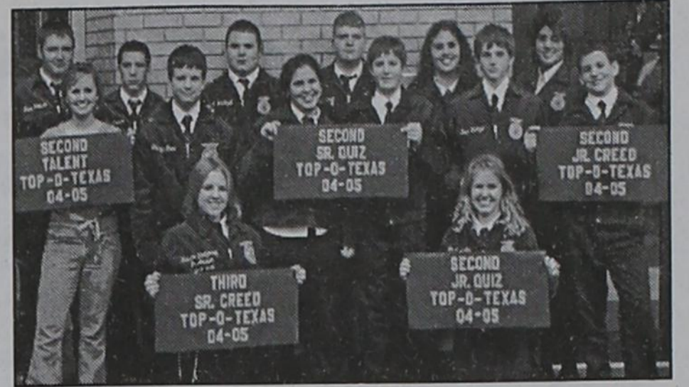
Gruver FFA attends Top-O-Texas District Banquet