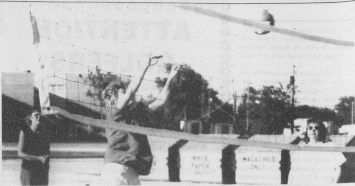
OVER THE NET - Summer has officially started, and with it comes the many activities that will be taking place for the City of Spearman's Summer Program. Pictured here are the women's division of volleyball. Games are played almost nightly, with the men and women taking turns each night.