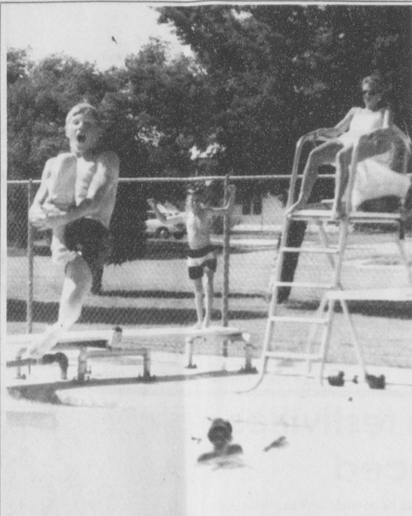
BIG SPLASH - The Gruver swimming pool has already opened its doors for the town of Gruver to cool off this summer. In the photo above, several kids are killing their summer time blues by playing in the cool liquid.

There will be a Private Applicator Training and test to obtain a private applicator license on Monday, June 12, starting at 9:00 a.m. in the Extension Homemaker's clubroom, 309 N. Bernice in Spearman. The test for the license will be given at 1:00 p.m. at the same location. For further information, call the Hansford County Extension Office at 806-659-4130 or 733-2901.