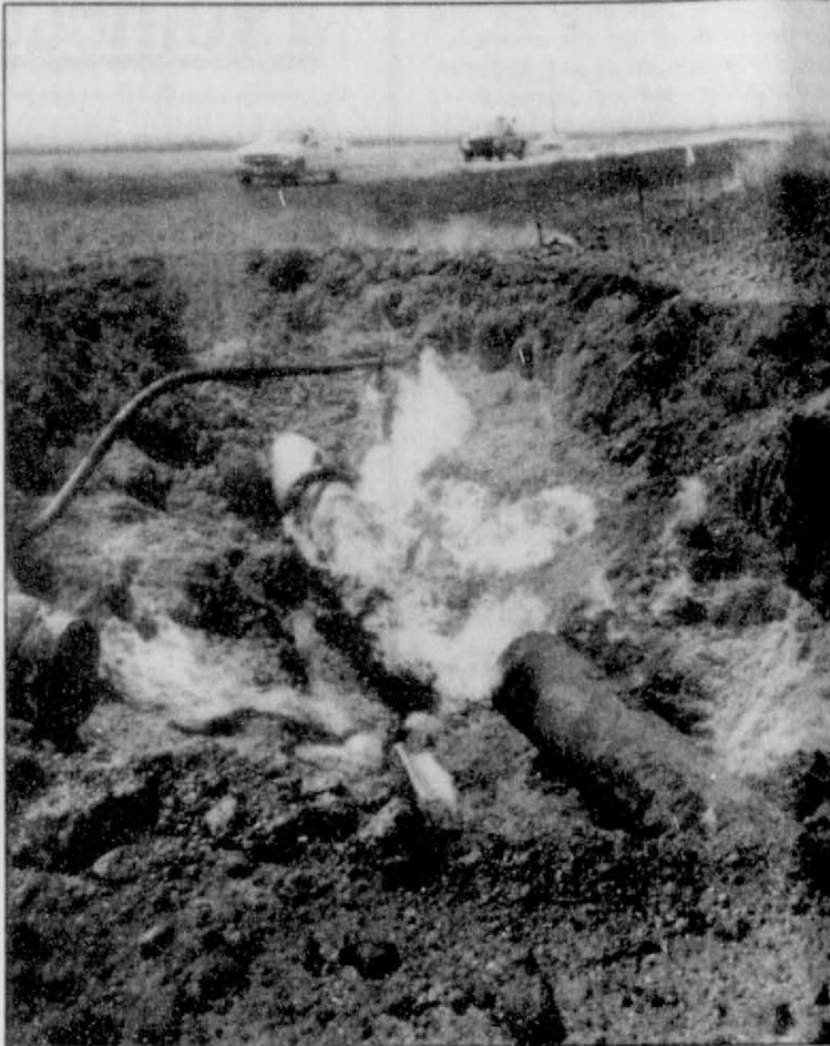
Pictured above is the natural gas pipeline that exploded on September 7th. The pipeline is located 18 miles northwest of Gruver.