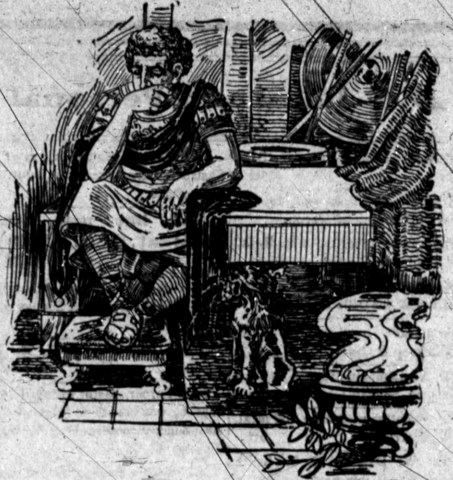
TITUS MOURNING OVER THE LOSS OF A DAY.

T ITUS, having let a day go by without having accomplished anything is said to have exclaimed reproachfully, "I have lost a day." When our Legislature adjourns without having accomplished anything "we have lost two years." It is a far cry from a government whose private citizens mourn over the loss of a day to the present time when members of the Legislature boast of filibustering tactics that result in losing two years and by playing truant, permit measures that would have built public highways, railroads and needed industries to die on the calendar.