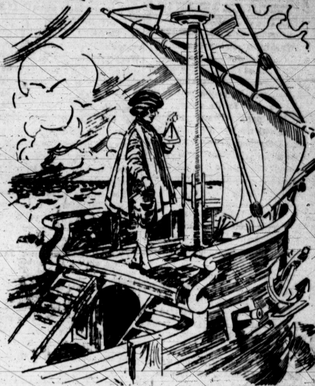
COLUMBUS DISCOVERING AMERICA.

COLUMBUS discovered America and Galileo discovered solar systems and planets and throughout all ages, civilization has been indebted to wise men who could think beyond the age in which they lived. We need in State government men who can see across two continents and look into the horizon of Twentieth Century civilization and discover new zones of trade, new worlds of industry and new planets of prosperity.