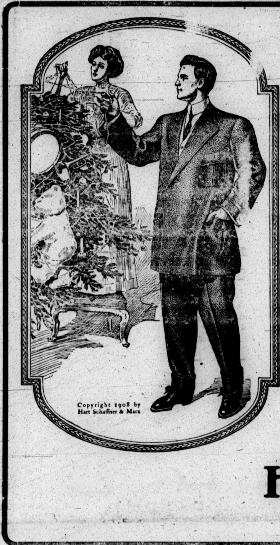
Copyright 1908 by Hart Schaffner & Marx

WHEN you get ready to spend your Christmas money and want to spend it in the most sensible way, not only to get value for it, but to get things that are sure to please those who receive them, come to us and let us show you what we can do to help you.