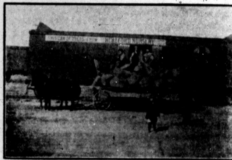
Shipping Trees by the Carload