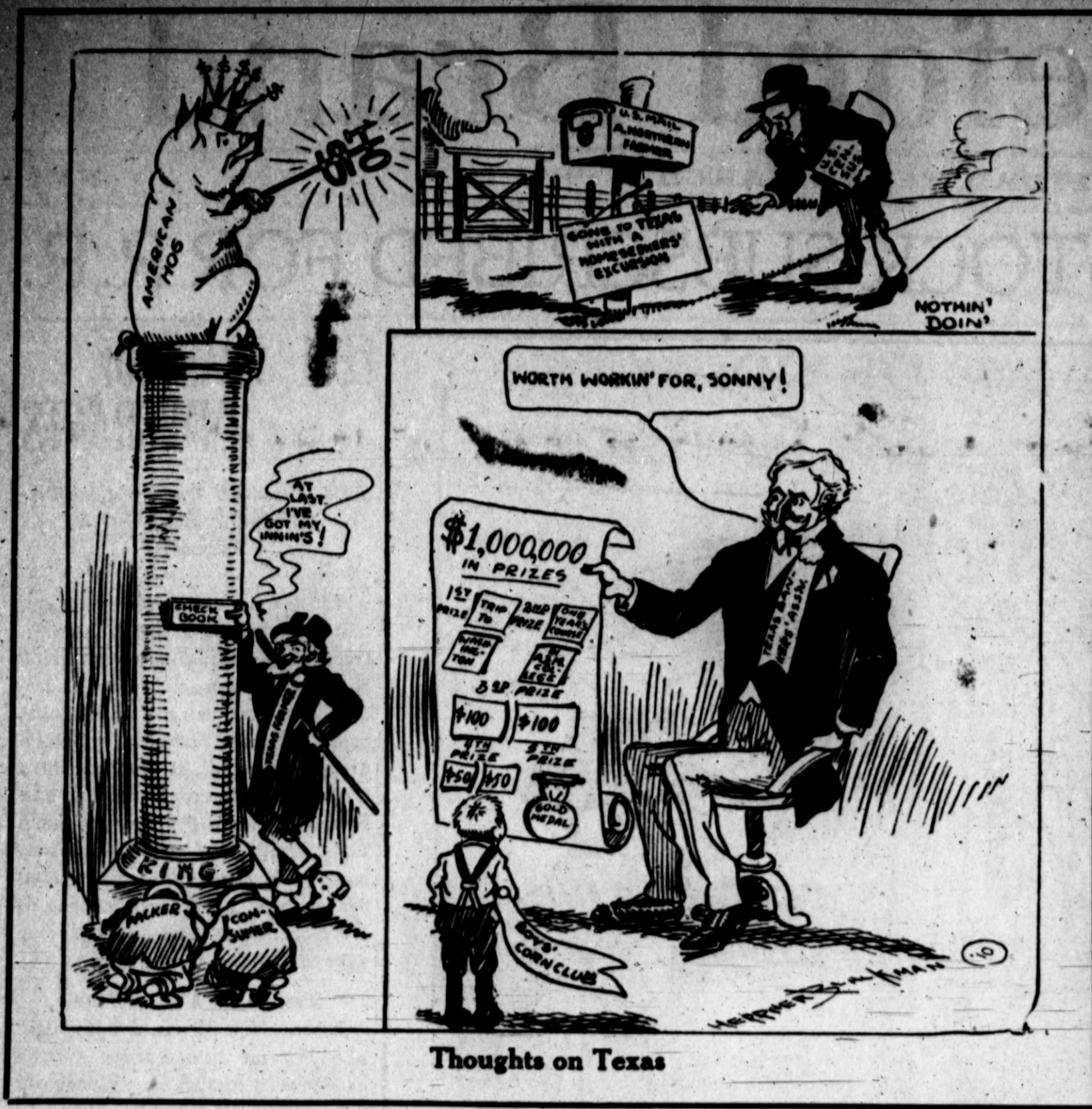
Thoughts on Texas