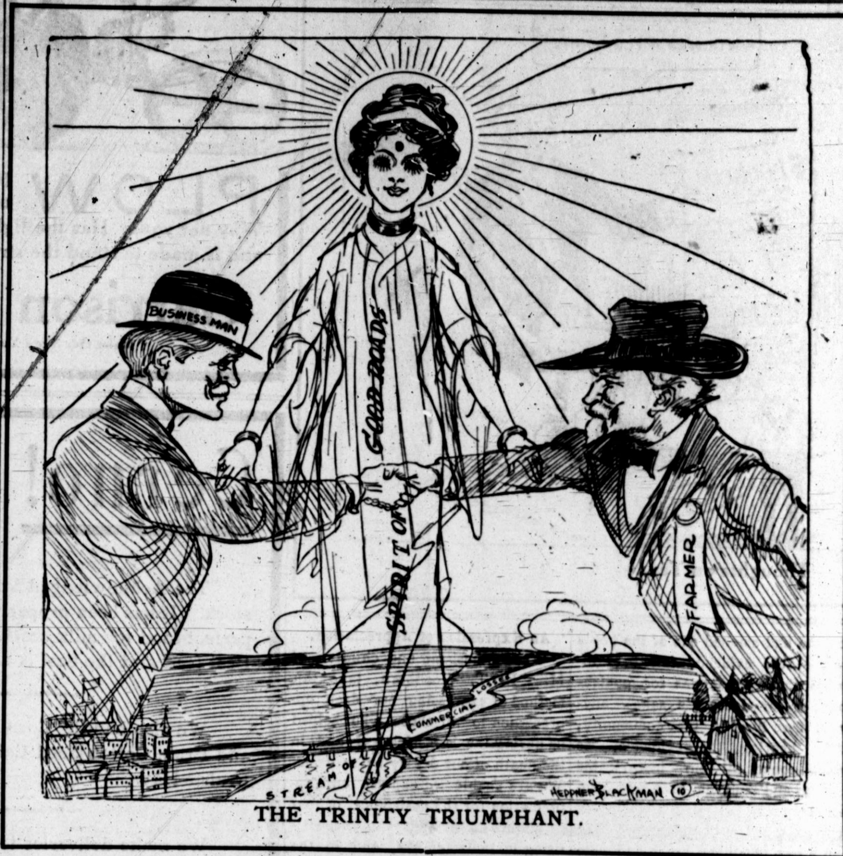
THE TRINITY TRIUMPHANT.