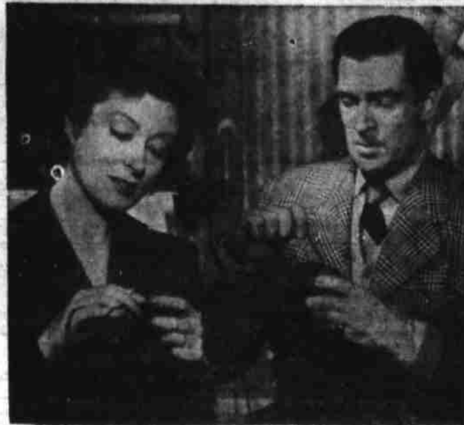
The Minivers—Greer Garson and Walter Pidgeon in a scene from "Mrs. Miniver," in which they play the British couple who meet the horrors and hardships of war with simple courage. The picture, considered one of the classics to come forth from Hollywood, is at the Ritz theatre today and Monday.

William Wyler, who recently gave the Republic hit film which presents a brilliant array of talent in one of the year's gayest and most entertaining romantic comedies.