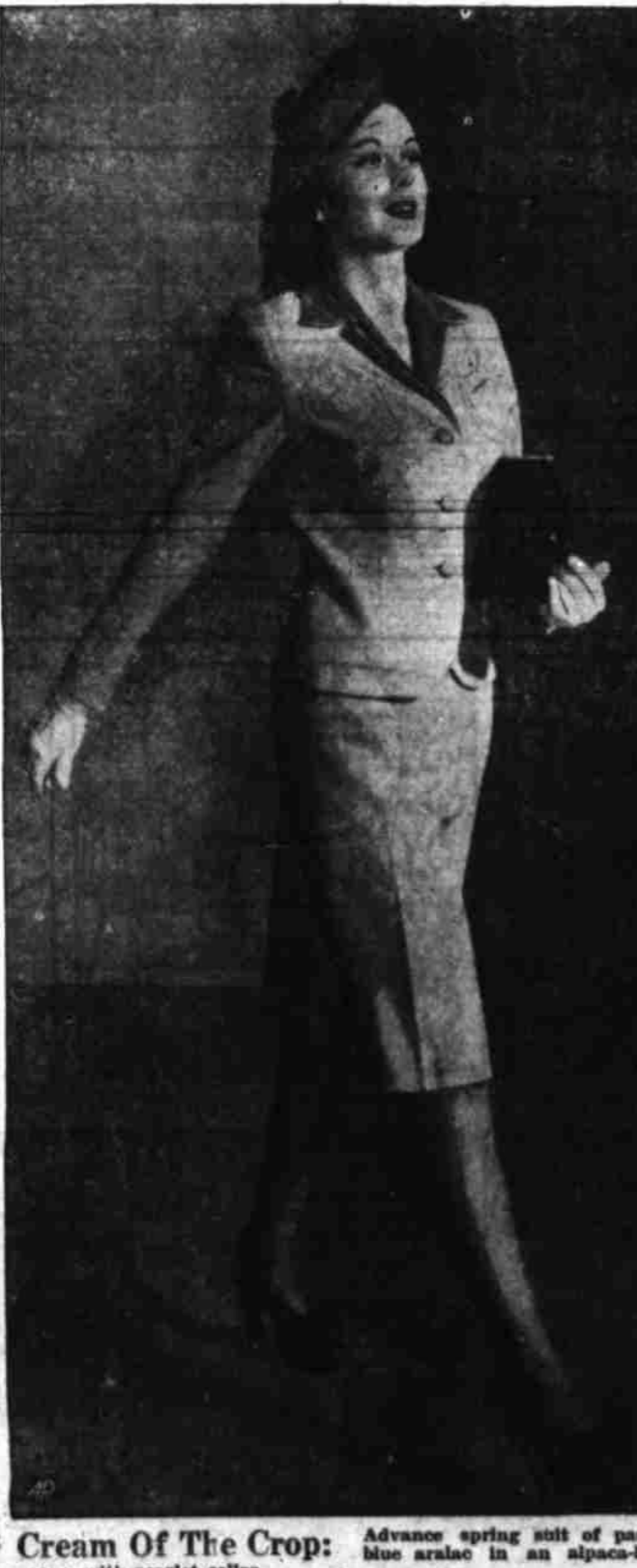
Cream Of The Crop: Advance spring suit of pastel weave, with scarlet collar.

COFFEE and COFFEE Attorneys-At-Law General Practice in All Courts LESTER PRINER BLDG. SUITE 215-16-17 PHONE 501