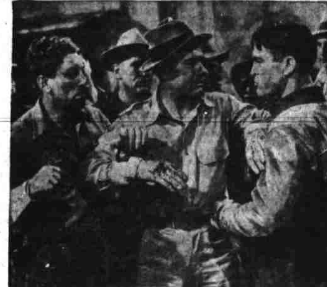
Tough?—Here's a bit of action from "Wrecking Crew," a story of hard-fisted but soft-hearted men which is offered today and Monday at the Queen theatre. Richard Arlen, Chester Morris and Jean Parker have the featured roles.