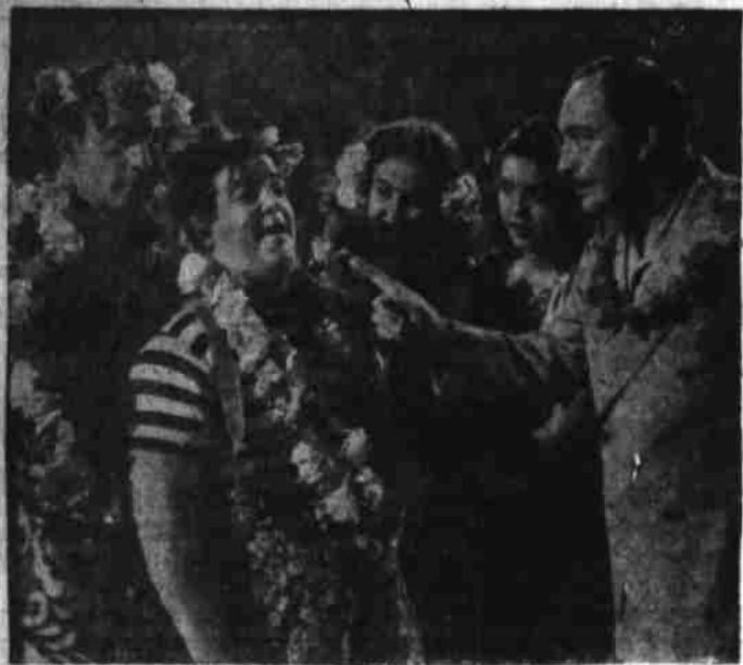
Those Boys Again—The perennial funsters, Abbott and Costello, are back to please the movie goers again, and appear at the State theatre today and Monday in one of their many successes, "Pardon My Sarong," a takeoff on the South Sea Island romances done as only Abbott and Costello could do it. Above is a scene from the picture.