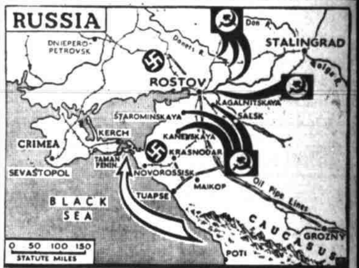
Nazis Trapped—Pointers show how Soviet offensive driven close to the seacoast to separate the Nazi armies in the Rostov and Novorossiisk zones. The white arrow shows how Nazis say Soviet commandos have landed on the Italian peninsula to block any German retreat across the Kerch strait into Crimea.

LONDON, Sunday, Feb. 7. (AP)—The Red army stormed forward at the last German defenses of Rostov south of the Don today and sent flying columns southward toward the Kerch straits to cut off the seaward escape of a large Nazi Caucasian army already virtually caught in a Russian noose by a lightning thrust to the Sea of Azov.