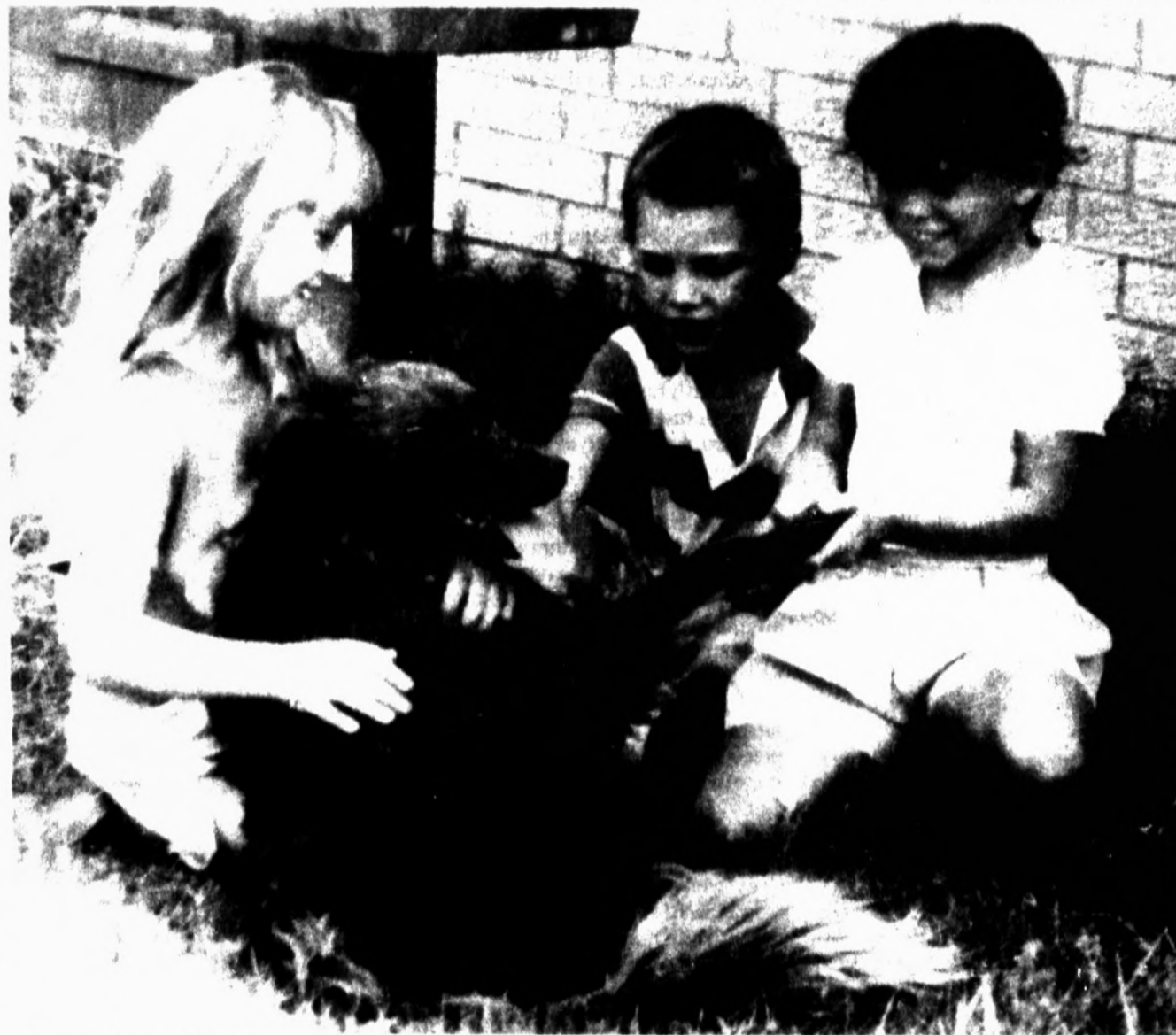
Dog day afternoon

In other action Monday at the commissioner's court meeting, the commissioners voted to award a bid to the low bidder — Gerhardt & (See COUNTY, Page 2)