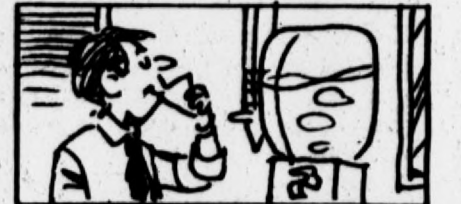
On the average, a person takes in about 16,000 gallons of water during his or her life.

Scrub potatoes and pierce several times with a fork. Bake at 400 degrees F. 50-60 minutes or until tender. Partially freeze steak to firm. Slice diagonally across grain into strips 1/8-inch thick. Combine 2 tablespoons soy sauce, cornstarch, brown sugar, ginger and red pepper pods. Pour mixture over strips, turning to coat. Marinate at least 5 minutes. Heat 1 tablespoon oil in wok or large frying pan over medium-high heat. Add vegetables and stir-fry 3-4 minutes. Remove from pan and keep warm. Add remaining tablespoon oil and stir-fry half of beef strips 2-3 minutes. Repeat with remaining beef. Return vegetables to pan. Add remaining tablespoon soy sauce. Cook and stir until sauce is slightly thickened, about 1 minute. Divide each potato into 2 portions. Spoon meat and vegetables over each half. Makes 4 servings. NOTE: Scrubbed, pierced potatoes may be microwaved on high in a 600 to 700 watt microwave oven, 10-12 minutes, turning once halfway through cooking time.