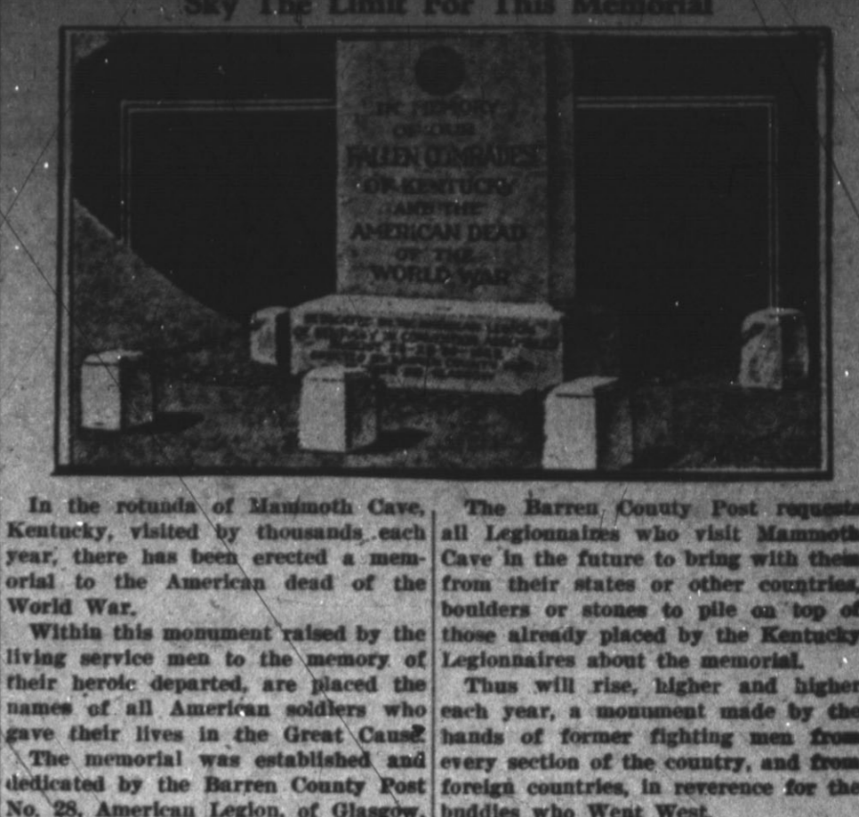
Memorial to the American Dead of the World War.

In the rotunda of Mammoth Cave, Kentucky, visited by thousands each year, there has been erected a memorial to the American dead of the World War.