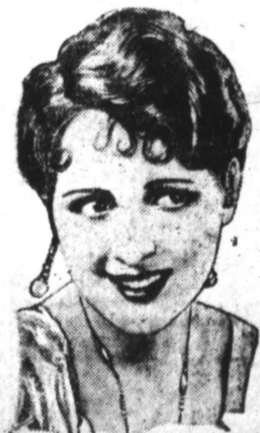
Billie Dove in "ADORATION"