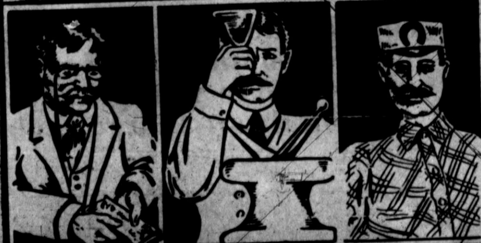
CONSUMER CHEMIST PAINTER