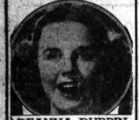
DEANNA DURBIN LEOPOLD STOKOWSKI

Here it is... heart-warming... exhilarating with the sensational charm girl of "Three Smart Girls," soaring to greater triumphs in this lovable entertainment!