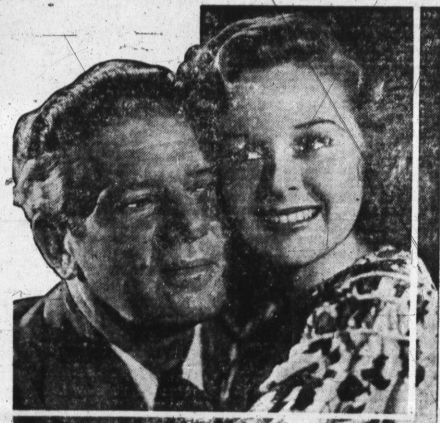
BOB BURNS AND SUSAN HAYWARD are slated to appear at the Star Theatre in the Saturday night preview and Sunday and Monday in "Our Leading Citizen." In this picture Burns pulls some strategic politics and has a few fist fights, with the ultimate result that he saves his home town from a political graft and gets the nomination for the Senate for himself.