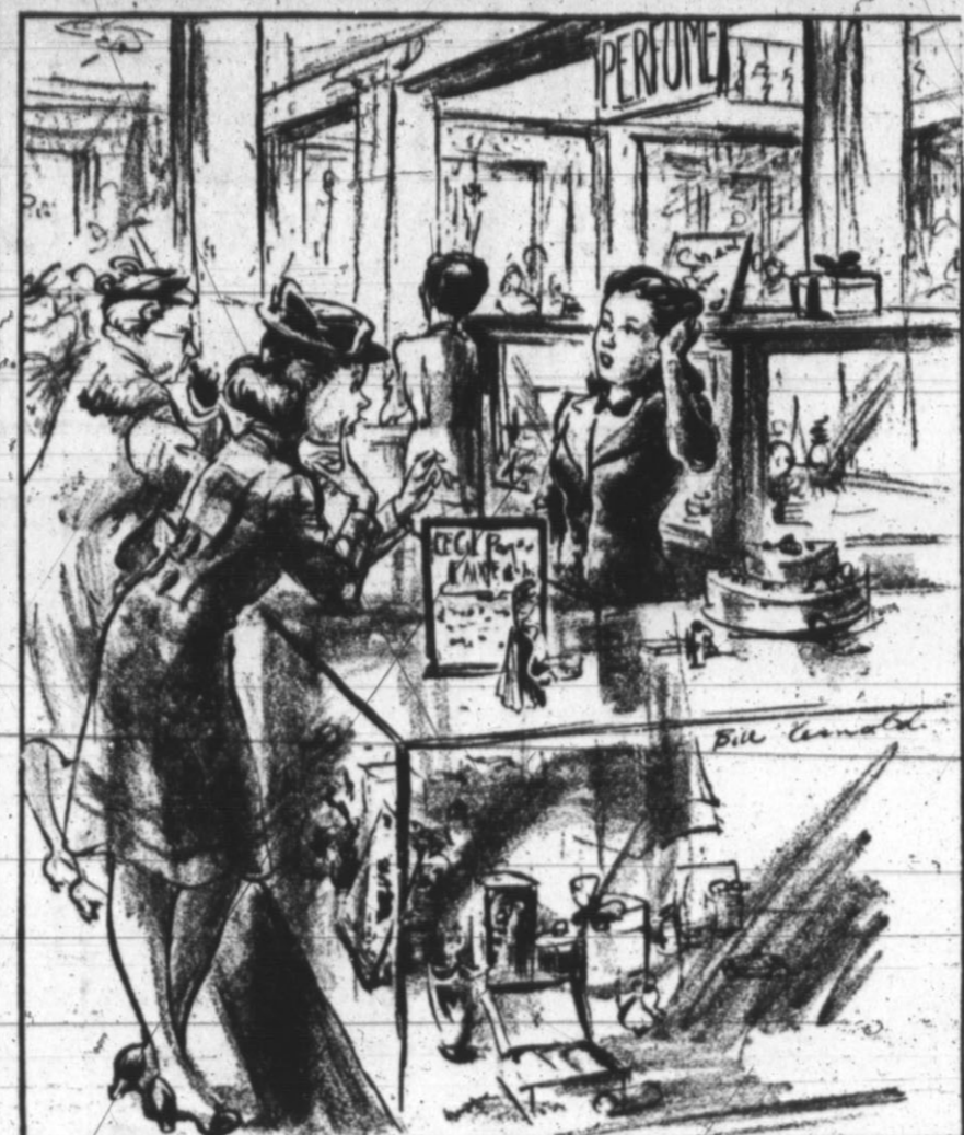
"I can't think of the name, but it's the kind they use in Hollywood to make themselves irresistible and alluring."