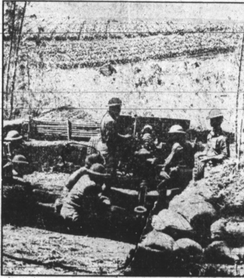
During recent Army maneuvers in Hawaii, soldiers man a 75-mm. gun while guarding a vital defense post. Troops are on the alert against any attempt by Japanese forces to effect a landing on the islands.