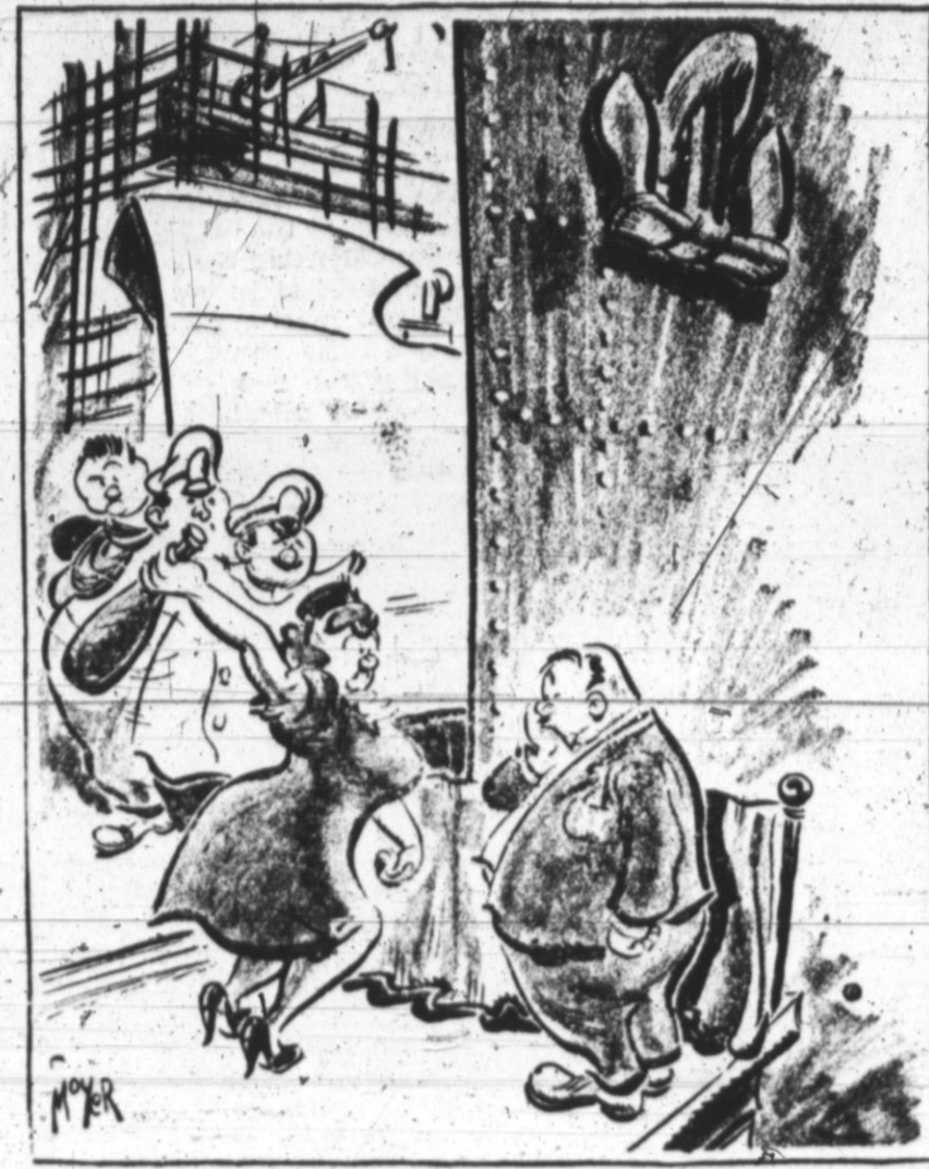
"Not too hard, dear. It costs money to repair them."