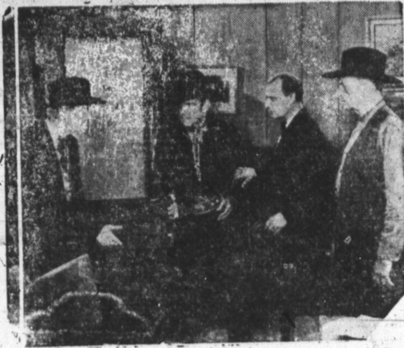
Action aces Buck Jones and Tim McCoy together with top western comic, Raymond Hatton, form the starring trio for "Gunman From Brodie," part of the double feature bill at the Star Theatre Friday and Saturday. The story, laid in the cattle country of the southwest, is an adventurous tale of the pursuit of a band of stock thieves by undercover U. S. Marshals, and is "tops" for thrilling action, daring horsemanship and sustained interest.