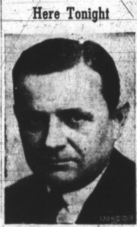
James V. Allred, former Federal Judge and Governor of Texas, will speak on the courthouse lawn tonight at 8:30 o'clock in behalf of his candidacy for the office of U. S. Senator from Texas.