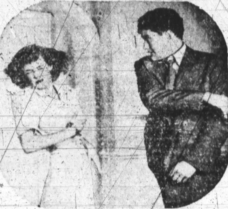
Lette Davis takes one on the chin from Dennis Morgan in "In This Our Life," a picture from which she rises to great new heights of ecstasy. The film will be shown here Sunday, Monday and Tuesday at the Star Theatre.