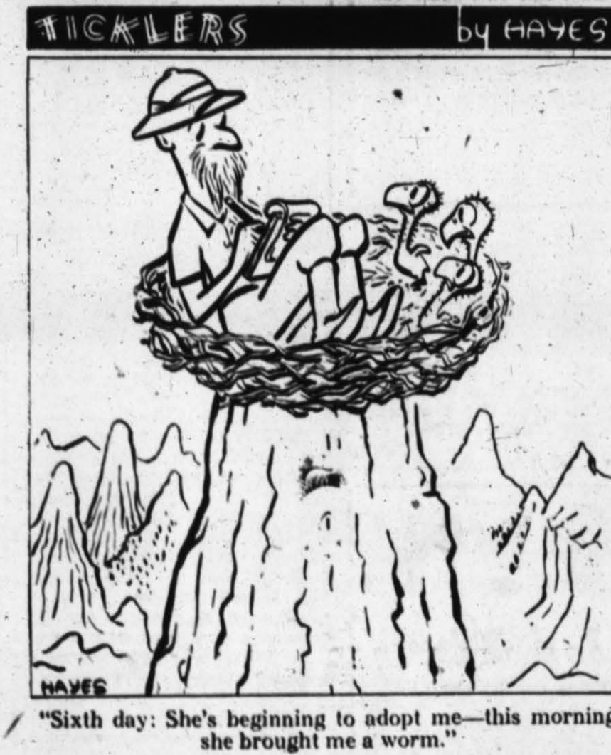
"Sixth day: She's beginning to adopt me—this morning she brought me a worm."