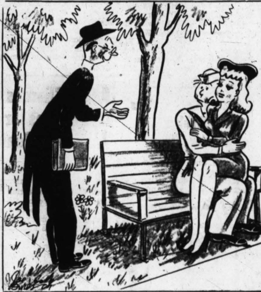
"Mind if I join you?"