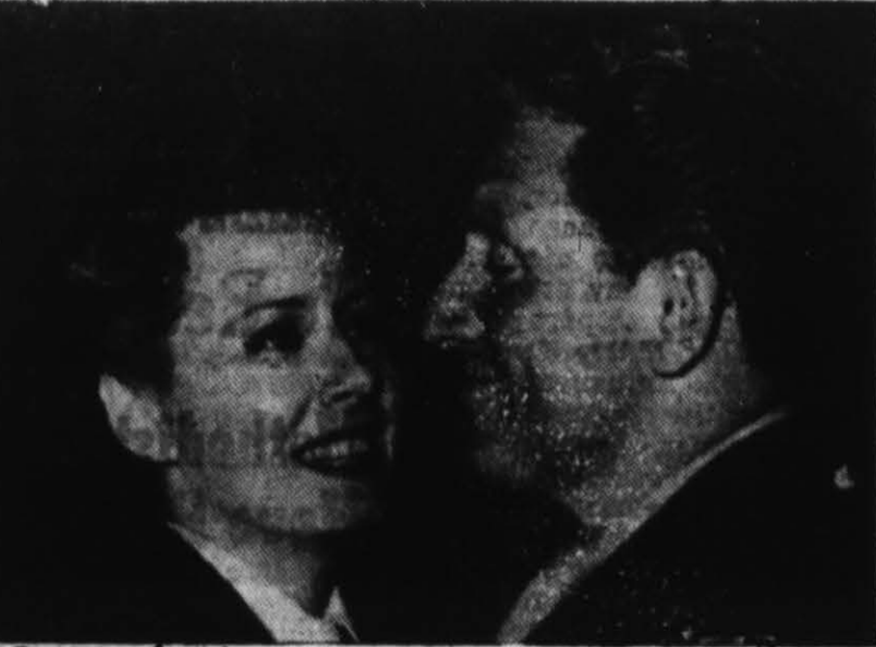
IRENE DUNNE and SPENCED TRACY together on the screen for the first time, give two of the best performances of their careers in "A Guy Named Joe," a tender and moving romance fashioned around the theme that good pilots never die. The picture, is the week-end attraction at the Star.