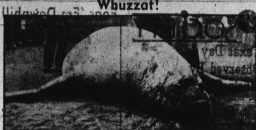
Whuzzat! It's an Australian dugong, or manatee. The sour-looking specimen showed up in the streets of Punta Arenas, Chile, one day, scaring the daylight out of natives. When it headed back toward the Straits of Magellan, police shot it dead, and Punta Arenas' 40,000 breathed easily again.