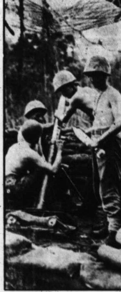
Marine mortar men behind a camouflaged sandbag breastwork feed shells into a mortar in support of riflemen advancing against the Japs on Cape Gloucester, New Britain.