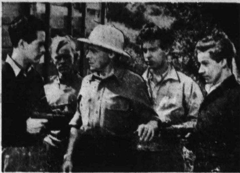
A NEW SERIAL, "Adventures of the Flying Cadets," will start Friday and Saturday at the Texas; and there are action and thrills in the time-honored serial tradition with a plot concerning the adventures of four intrepid cadets who became involved in a spy plot. Featured are Johnny Downs, Eduardo Cianelli and Bobby Jordan, pictured above.