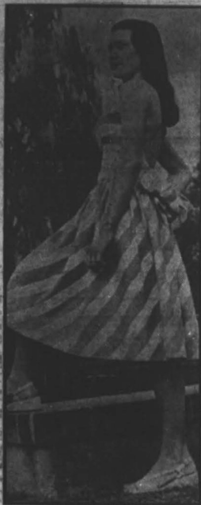
Wide pink and white diagonal stripes pattern this Pat Premo creation, an all-purpose sun-back dress of striped cotton chambray with full skirt, halter front and wide sash that ties in a big bustle-bow in back.

50 feet of Lots 7 and 8 and East 50 feet of South 40 feet of Lot 9, all in Block 21 of Whitehead addition.