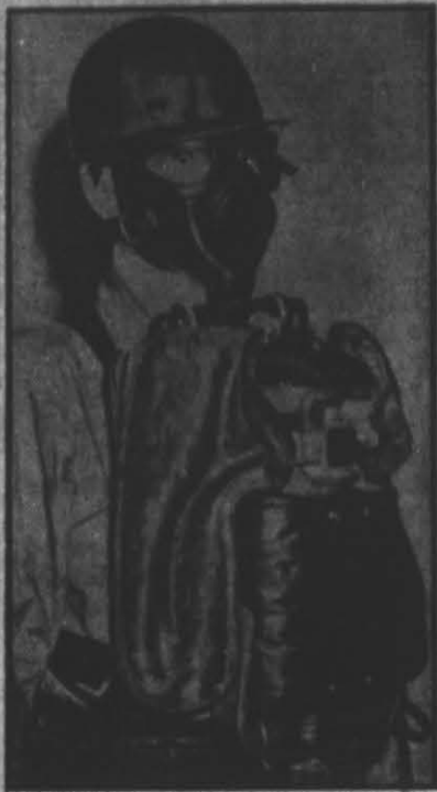
This is how men designated to board atom bombed ships in Bikini Atoll look garbed for duty: helmet of lightweight bakelite plastic, Navy-type rescue breathing apparatus. Boarding crews must extinguish fires, rescue instruments, and salvage material for examination.