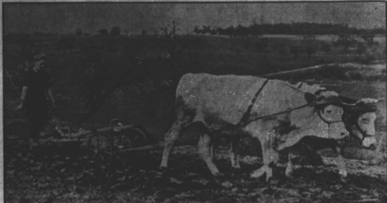
Spring planting with bullock power and an old-fashioned hand plow is one reason food lack for Europe's war-ravaged millions is so serious. This German woman is breaking ground for the 1946 crop—but it can't possibly be enough!

Local Mills Feel Pinch Local flour mills are already feeling the pinch of the grain