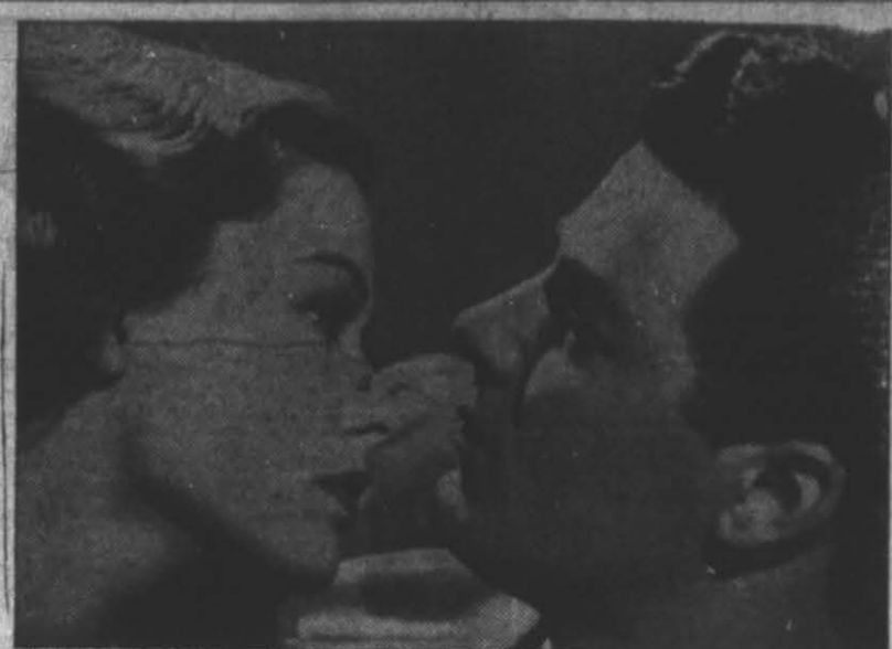
Gene Tierney and Cornel Wilde as they appear in a scene from "Leave Her to Heaven" which opens at the Star Sunday.