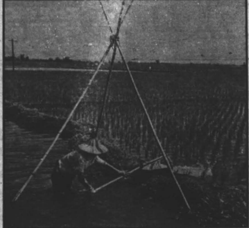
FORMOSA'S farming methods are still primitive. Here a Formosan woman performs the back-breaking task of hand-pumping water from an irrigation ditch to a rice paddy. The scoop is made of bamboo, so is the tripod. She does this all day long, day after day, to keep that big field watered.

Fraser Mills were still in production this week, and, though grain supplies are low, are still milling a small quantity of flour for local sale. Fraser, however, reports that government orders for export flour will probably keep the mill in operation until wheat harvest.