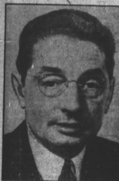
Joaquin Miguel Elizalde is first Ambassador to the U. S. from the new Philippine Republic.