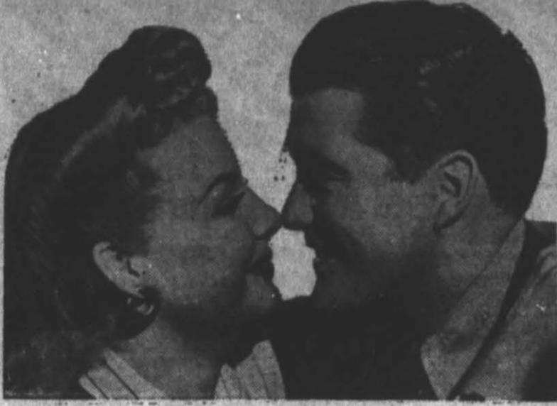
Ann Sheridan and Dennis Morgan face the future brightly in "One More Tomorrow" showing at the Star Theater Sunday, Monday and Tuesday.