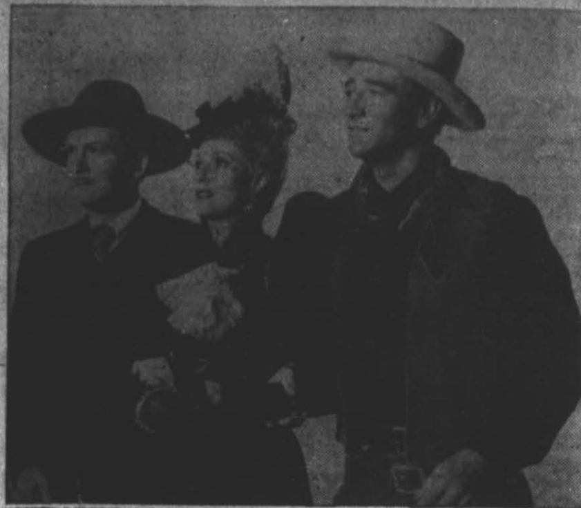
Albert Dekker, Martha Scott, and John Wayne are the stars in the Republic production, "War of the Wildcats", showing at the Texas Theater Sunday and Monday.

Most pruning should be done immediately after flowering. On the true rambler type, remove