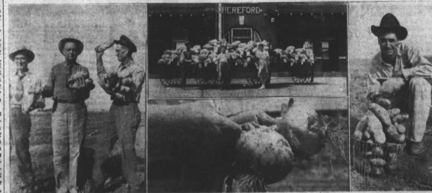
Hereford Spuds are getting a round! The First National Bank of Amarillo last week shipped 90 sacks of choice Deaf Smith potatoes by Railway Express to friends and customers all over the country.