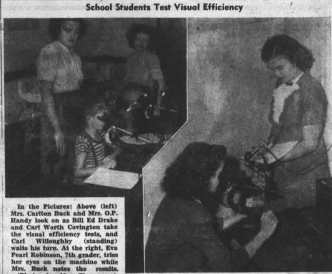
School Students Test Visual Efficiency