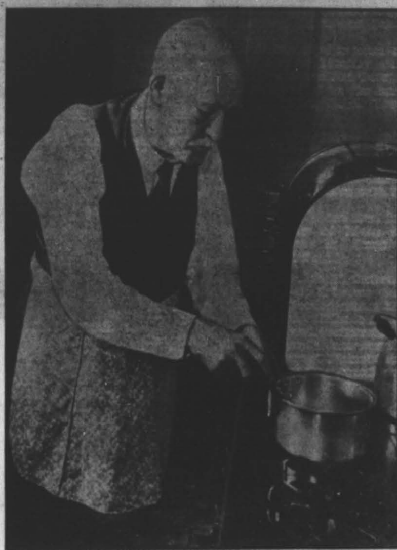
It's Wisconsin's 83-year-old Republican Gov. Walter S. Goodland, the nation's oldest governor, cooking with gas on the front burner in the governor's mansion at Madison after re-election.