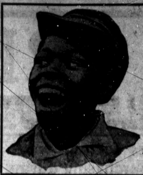
Meet me at Harrison's coal yard 17th

We wish to state in as plain and vigorous way as words can express it that Hunt's Cure will positively, quickly and permanently cure any form of Itching Skin disease known. One box is guaranteed to cure. One application affords relief. 18-41