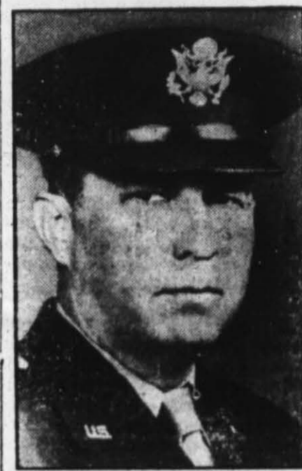
Brig.-Gen. Kenneth C. Royall, 51, former Goldsboro, N. C., attorney, is the new Undersecretary of War, succeeding Robert P. Patterson.