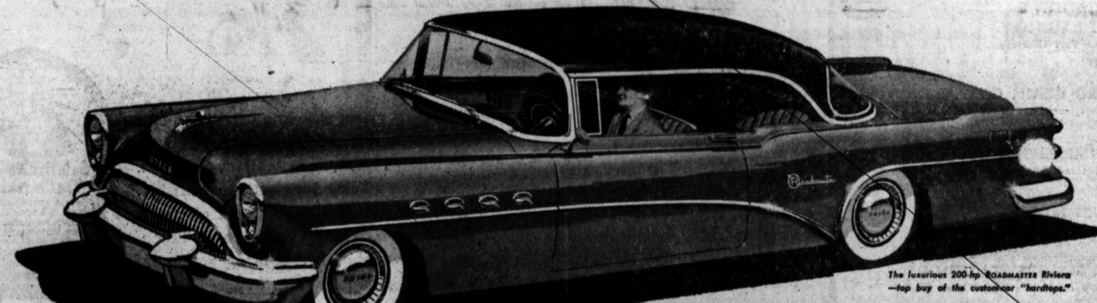
The luxurious 200-hp ROADMASTER Riviera —top buy of the customer "hardtops."