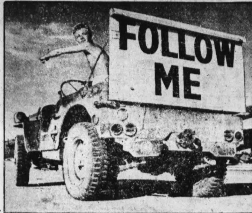
Big bombers based on Eniwetok of the Marshall Islands, now a U. S. base, follow the lead of this jeep when looking for parking places after landing on the supply-jammed atoll.