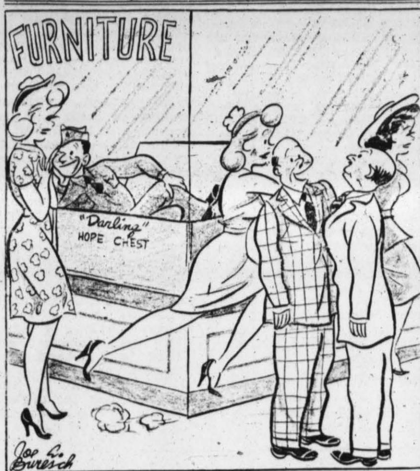
"I was stuck with a flock of hope chests until he came home on furlough with that idea."