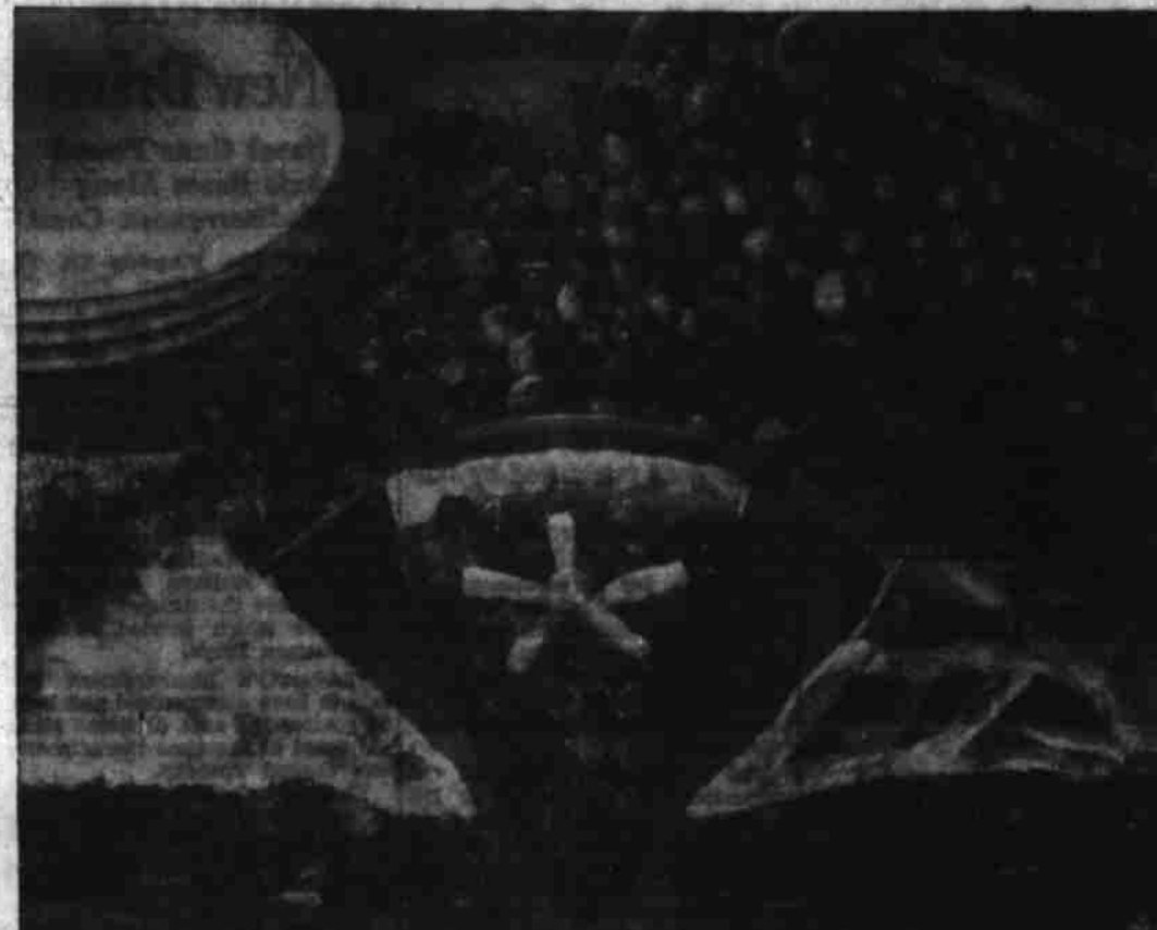
THEY'RE THE BERRIES: Of cranberries, in this instance, for Thanksgiving pies and sauce that make second helpings automatic.