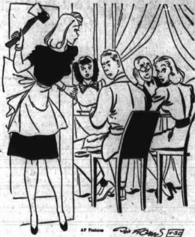
"Please just be patient, folks."

Trademark Registered U. S. Patent Office