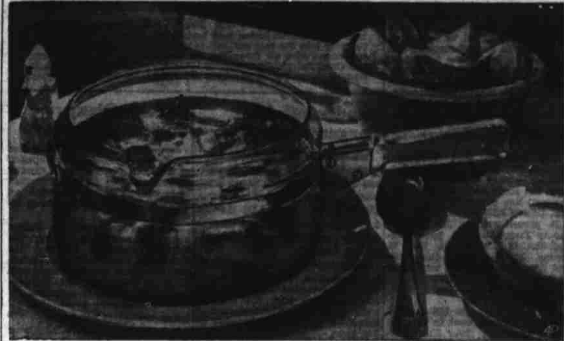
Dried Beef and Corn Make One Square Meal