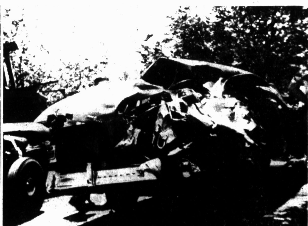
THREE MEN DIED and a fourth was seriously injured Saturday night when this 1953 Mercury, seen here from the back, skidded into the path of a truck near Black. The Mercury pulled suddenly from behind another car and was directly in the path of the truck. When the driver of the car tried to pull back, his vehicle went out of control and was hit on the back by the truck. Traffic was tied up for some time before the wreck could be cleared from the road. The truck driver was not injured.