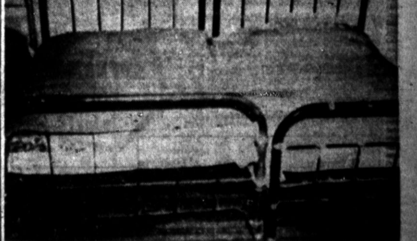
NEW SINGLE BEDS with foam rubber mattresses to replace these double beds with cotton mattresses were recommended by the district court grand jury which met Monday. The recommendation was made directly to the Deaf Smith County commissioners' court, and was signed by all members of the grand jury who were present when the recommendation was prepared. Jurors must sleep in the dormitory on the fourth floor of the courthouse when a case continues for more than one day.