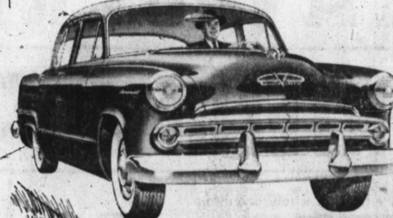
Dodge Coronet V-8 Four-Door Sedan