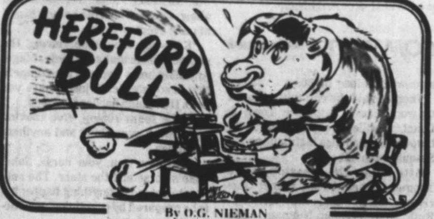
By O.G. NIEMAN

In addition to thousands of famous national brand products, all Revco drug stores also feature more than 700 private label products. Revco places heavy emphasis on its prescription business, currently filling more than 57 million prescriptions annually. The store in Hereford will have a pharmacist on duty during all store hours.