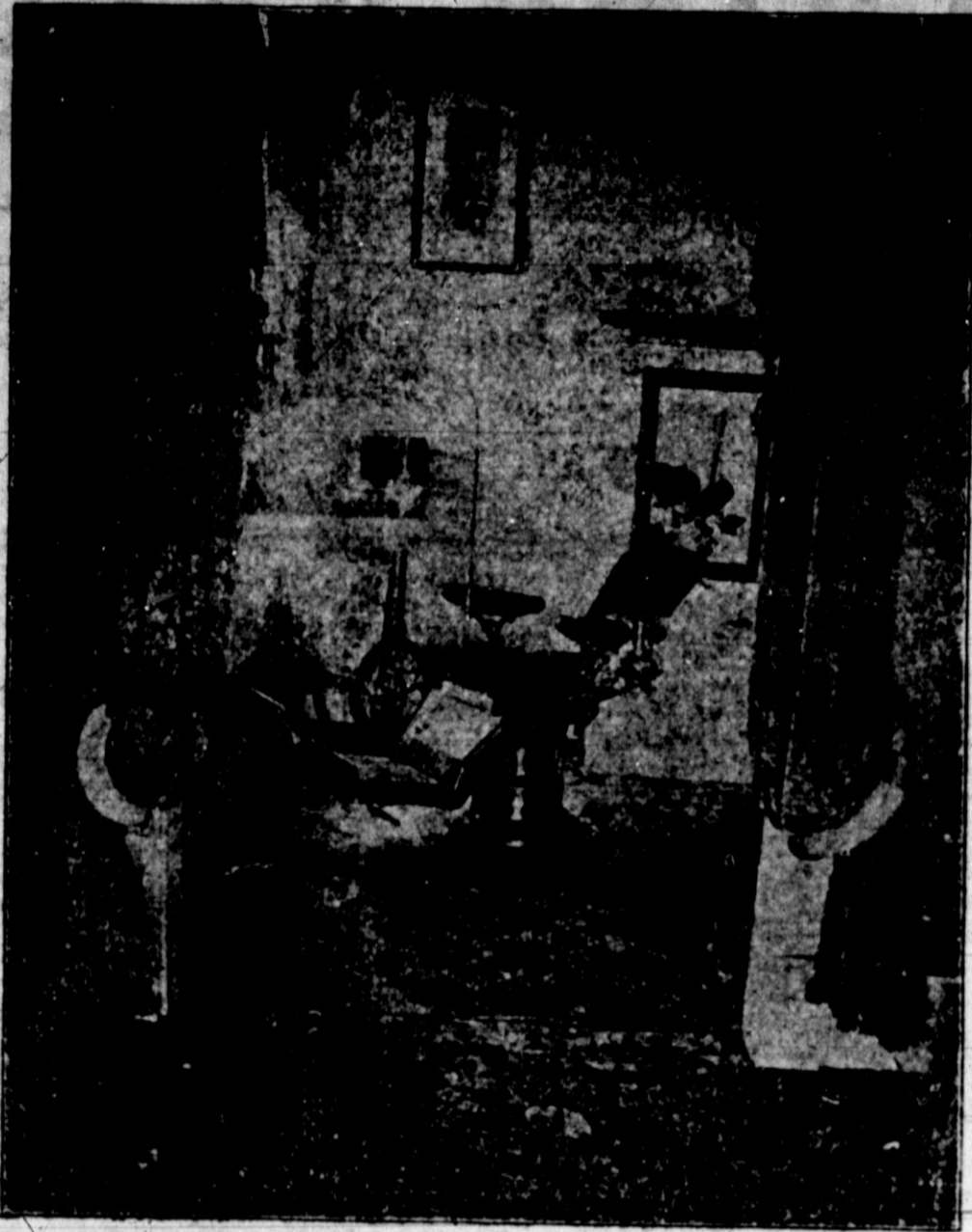
INTERIOR VIEW OF OUR OPERATING ROOM