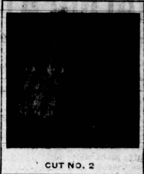
CUT NO. 2

Preserve the crowns of the children's teeth till wonderful nature has time to do its work. Nature intends for the permanent teeth to follow the roots of the temporary teeth as they absorb, but when you allow your children's teeth to decay and the nerves to become exposed and die an abscess results and extraction is necessary, nature is thwarted, and, instead of the arch of the mouth expanding for the recipiency of the permanent teeth, the arch is necessarily contracted and conditions as illustrated in No. 2 are inevitable. Of course these conditions can be remedied, but it requires a great deal of time, patience and expense, also a skillful Orthodontist that you don't often find. Few dentists will hazard their reputation on such cases. So parents watch your