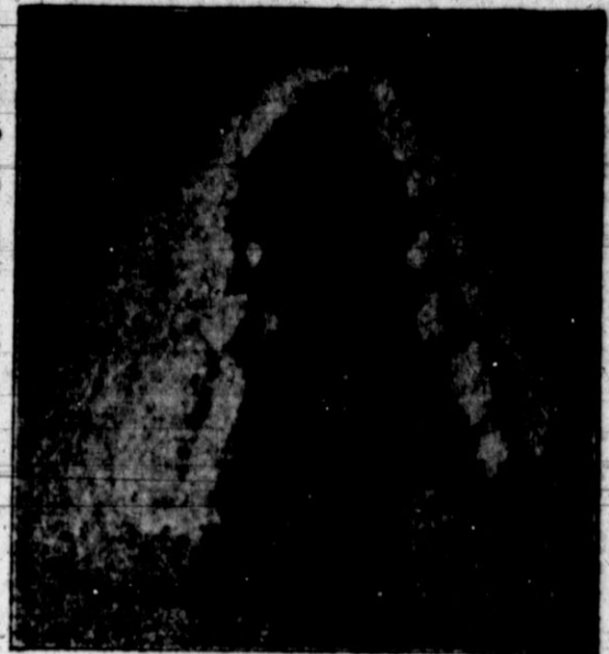
CUT NO. 1