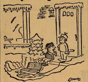
"It might be slow but it's easy!"