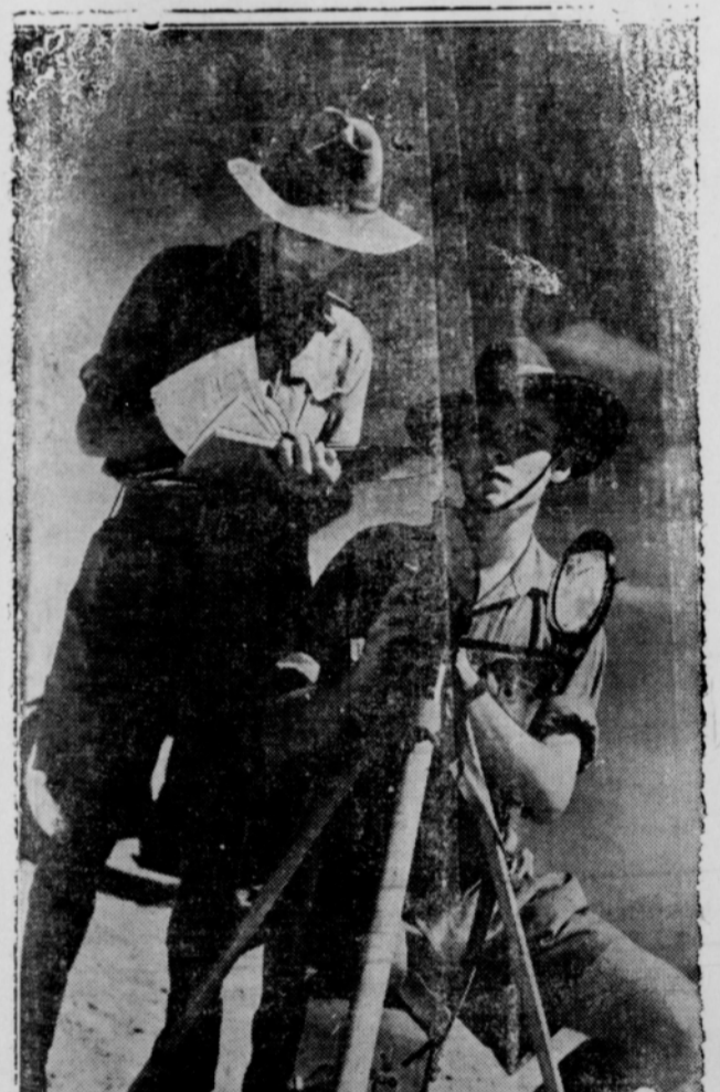
Among the most dramatic of the fighting forces of the Allies are the colorful Anzacs whose valor in battle, good humor and fellow ship with their Allies, and strength under the most trying fighting conditions are legendary. Fighting side-by-side with the countries of occupied but unconquered Europe, and the sister nations of the British Commonwealth, the Allies are massed in great strength. Their recruits are drawn from those escaping daily from Europe while the Anzacs travel the world around to lend their physical and moral aid.