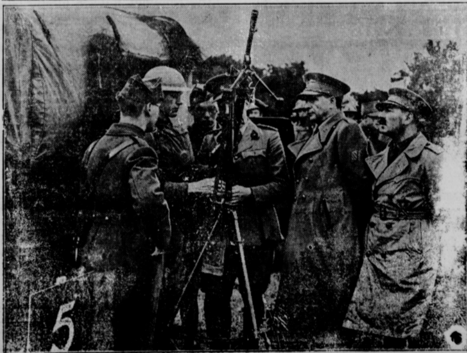
Intensely interested in a new Bren anti-aircraft machine gun mounted for combat against low flying enemy planes are high-ranking officers of the Allies—Australians, Belgians, Czechoslovaks, Free French, Greeks, Luxembourgers, Dutch, Norwegians, Polish and Yugoslavians—now fighting for the common cause of a free and new order in Europe. The Allies are training side by side and ready to fight side by side for a new world of free men.