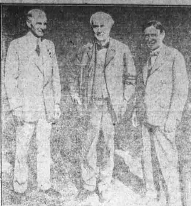
Three leaders of American industry—Henry Ford, Thomas A. Edison and Harvey Firestone (left to right)—are shown at the Edison laboratory at Ft. Myers, Fla., where they assembled to talk over Edison's experiments with rubber substitutes.