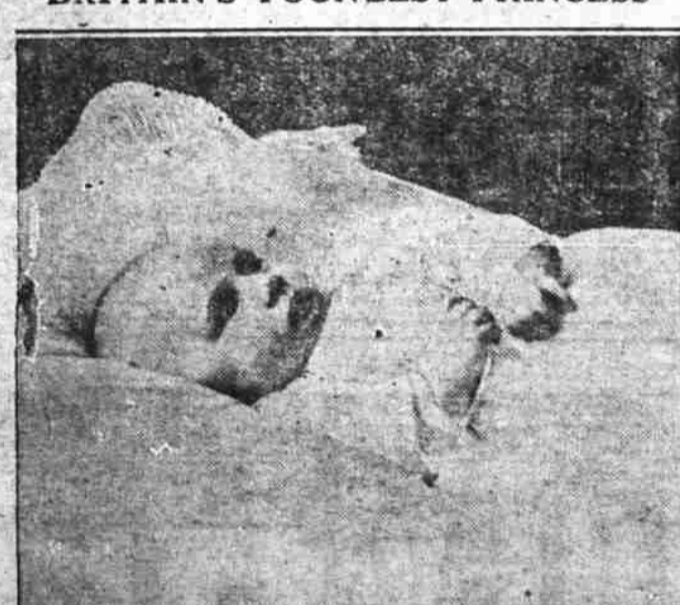
Little Princess Margaret Rose, second daughter of the Duke and Duchess of York. She was born August 21 at Glamis castle in Scotland and christened recently at Buckingham palace.