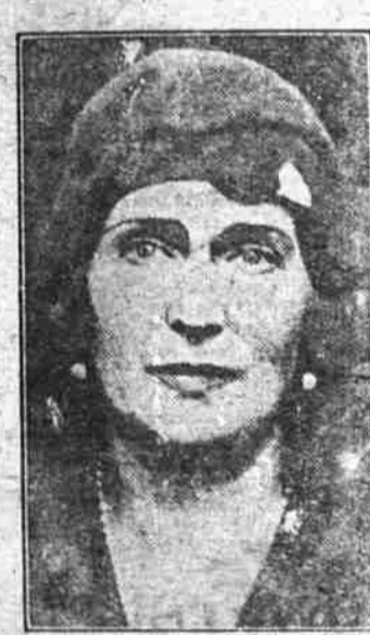
Queen Victoria of Spain received an enthusiastic welcome from supporters of the monarchy when she returned to Madrid from London where she had been visiting her mother.