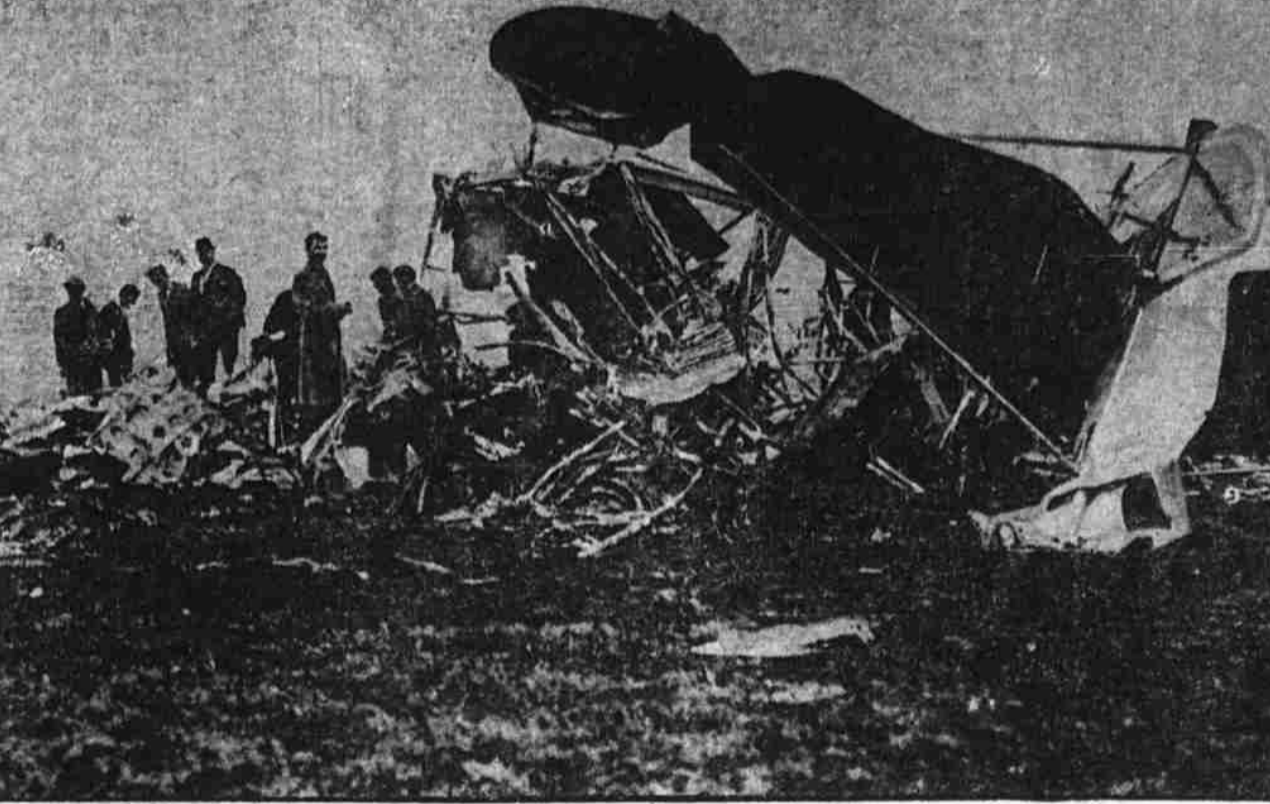
The twisted wreckage of a Transcontinental & Western Air plane which fell in a field four miles southwest of Bazaar, Kan., yesterday afternoon, carrying to their deaths two pilots and six passengers, among them Knute Rockne, most famous of football coaches. The wing of the tri-motored plane, heavily burdened with a coating of ice, came off under a sudden strain. It was found half a mile from the fuselage.