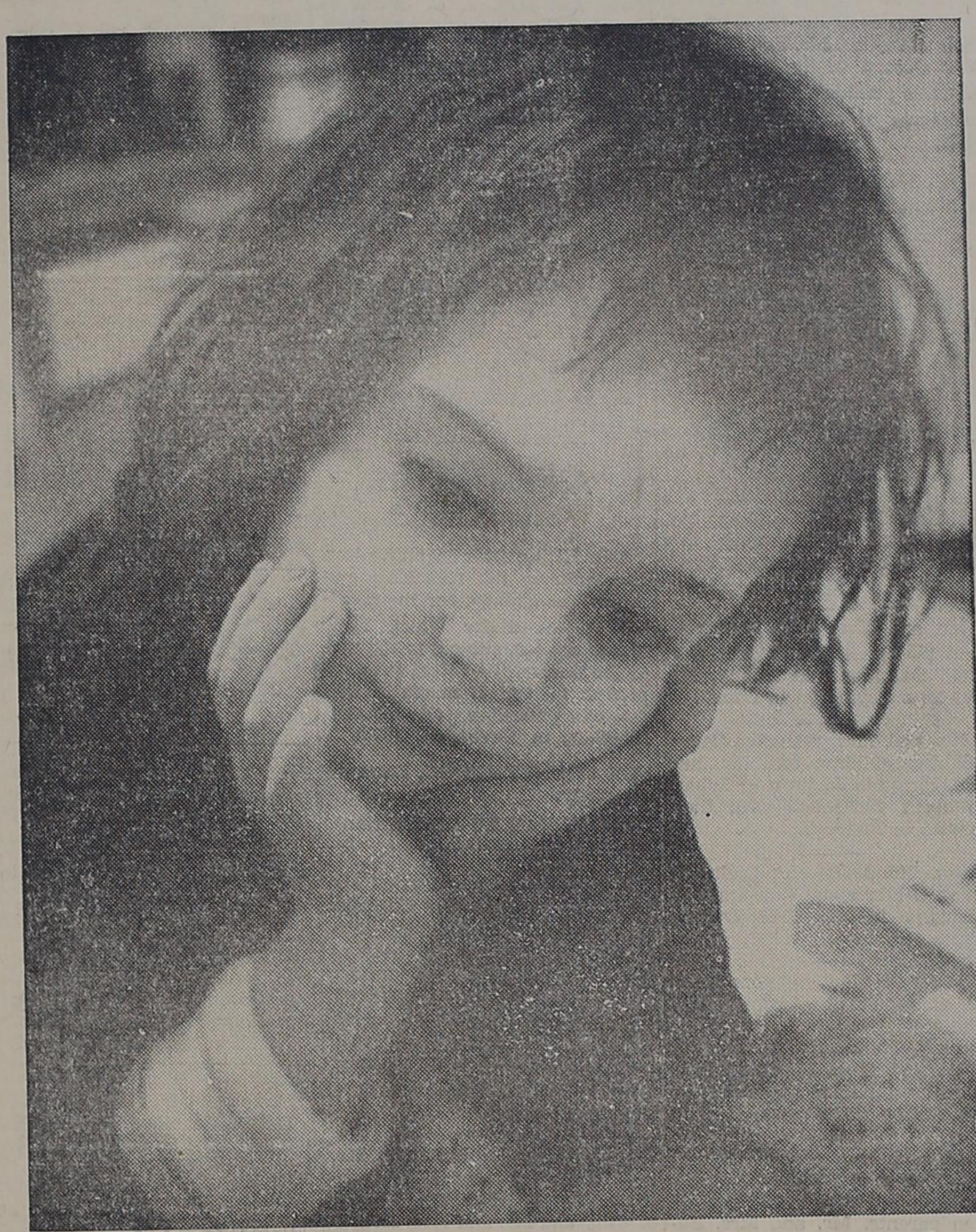
What's in a pocket of poverty?

People. People suffering indignity and inhuman frustration.