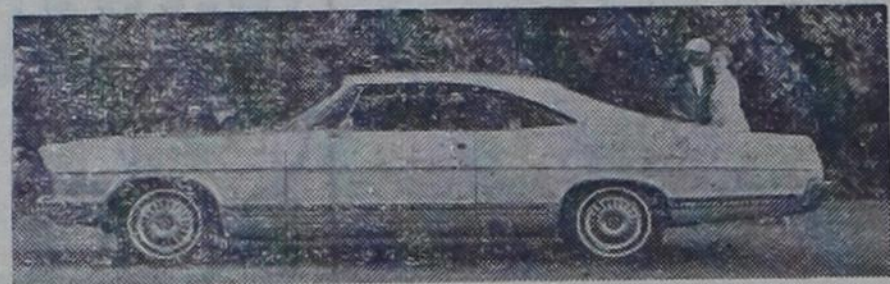
Dramatic new styling marks the 1967 Ford which has received a major sheet metal change for the third time in three years. Pictured here are the X/L Convertible (above) and the X/L 2-door Hardtop, both of which offer Ford's Select Shift Cruise-O-Matic transmission as standard equipment. Featured only on the Fairlane GTA in 1966, Select Shift permits the driver to shift manually or automatically. Ford's new styling features sculptured side panels and a gull-wing design grille that is die-cast in the X/L, LTD and Country Squire series. Engineering improvements give the 1967 Ford an even quieter and smoother ride. All Ford models will be on display at Ford dealer showrooms Friday, Sept. 30.