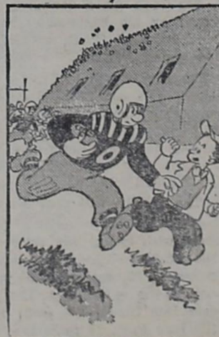
"Important phone call!"