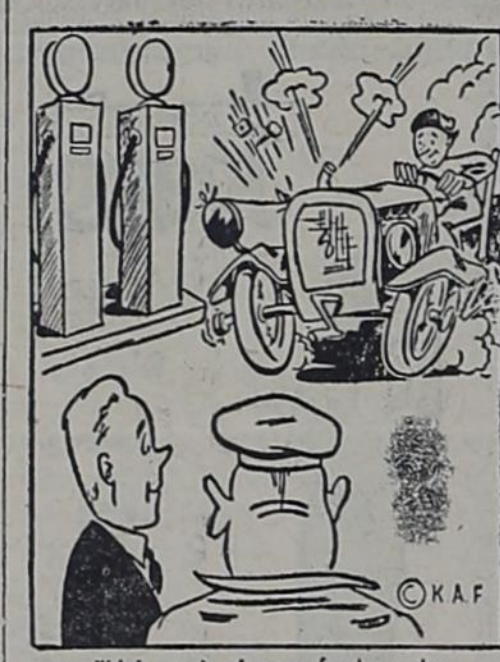
"He's coming in on a fender and a prayer."