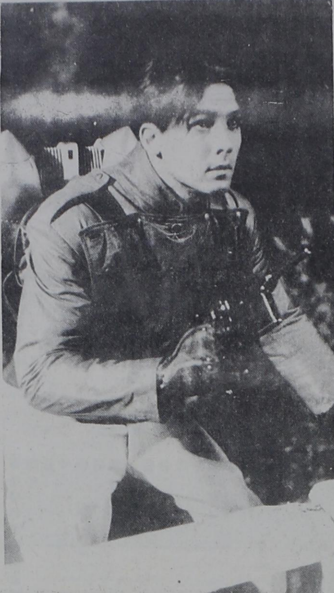
Bill Campbell stars as air racing pilot Cliff Secord, who finds a rocket pack that enables him to fly. This Walt Disney live-action adventure will show at the Majestic in Eastland, beginning Friday, August 16.