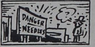
A shower of needles was the result of a cyclone striking a factory that made knitting needles.

comic book to movie screen began in the mid 1980's with 'The Rocketeer' which competed several months ago. The finished product is entertaining and exciting.