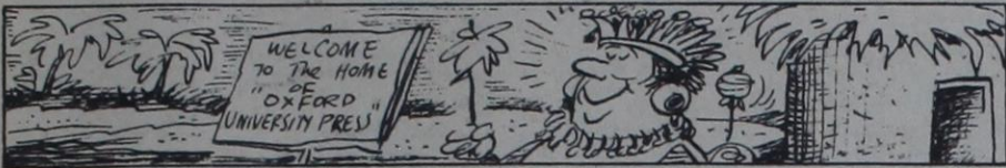
An African chieftain, when choosing an English name, dubbed himself "Oxford University Press."