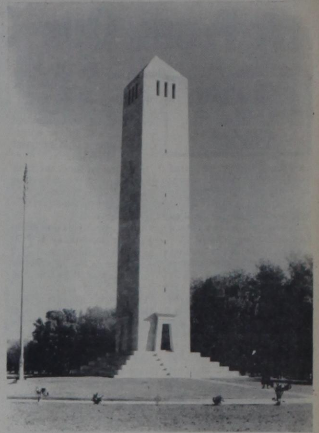
The monument and battlefield grounds at Chalmette National Historic Site.

Texas Coca-Cola Bottling Company Abilene, Texas