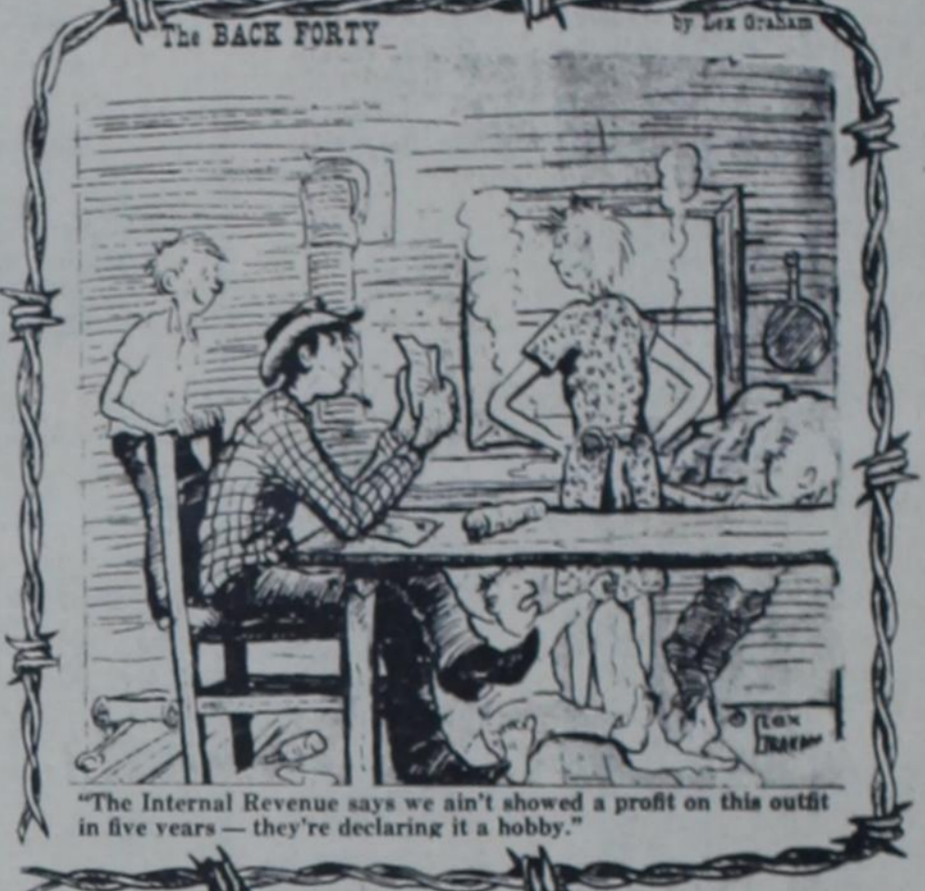
If the Internal Revenue doesn't declare your business a hobby and you need help paying your income tax, see us for a personal loan.