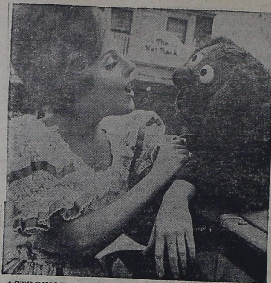
ASTROWORLD CHIT CHAT . . . Singer Lesley Gore and one of the star Muppets, Rowlf, are two of the stars of a one-hour television special show, "Pied Piper of Astroworld", which will be shown on 259 ABC stations Saturday morning, Dec. 23. Soupy Sales stars as the Pied Piper in the show staged entirely in Astroworld, next to the Astrodome in Houston.

Gifts were exchanged and all wished everyone - including you - a Merry, Merry Christmas with a great La Estrellita in 1969.