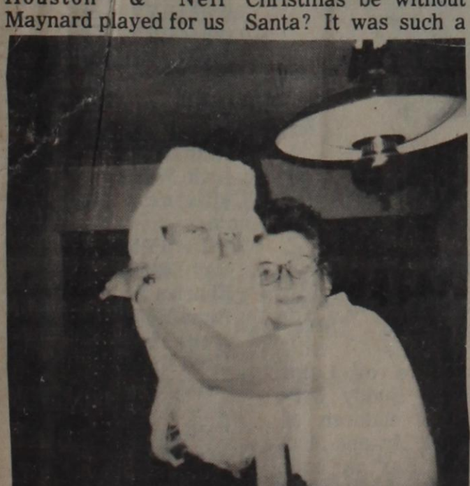
Every age loves Santa