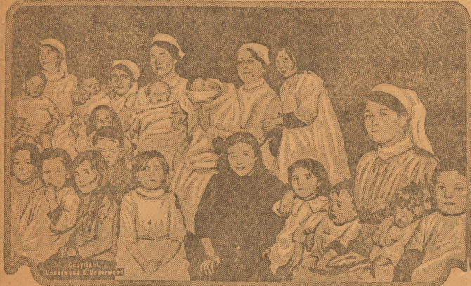
When the Germans make their ruthless air raids over London, the babes and their mothers have to take refuge in all manner of underground shelters. The photograph shows a group of them safe in an old cave that had been dried out and made ready for the emergency.