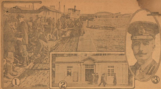
1—First photograph received from Riga since the capture of that Russian port by the Germans. 2—Information bureau for soldiers and their friends such as the commissions on training camp activities are erecting near all camp centers. 3—Gen. W. P. Marshall, who has succeeded the late General Maude as commander of the British forces in Mesopotamia.