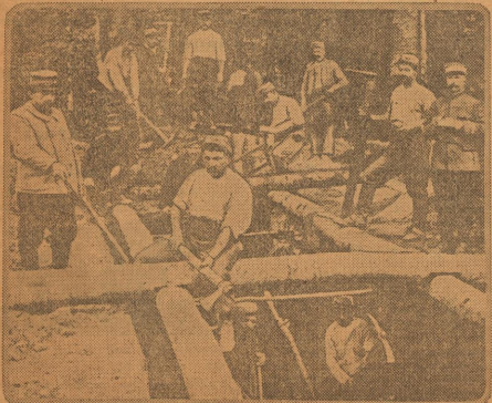
But service to one's country recognizes no age limit is evident from this photograph showing Frenchmen too old to fight constructing trenches and dugouts behind the battle lines. Each man, a volunteer, has released a younger man for duty at the front. Many of these men served France in 1870.

WOMAN'S CROWNING GLORY is her hair. If yours is streaked with ugly, grizzly, gray hairs, use "La Creole" Hair Dressing and change it in the natural way. Price $1.00.—Adv.