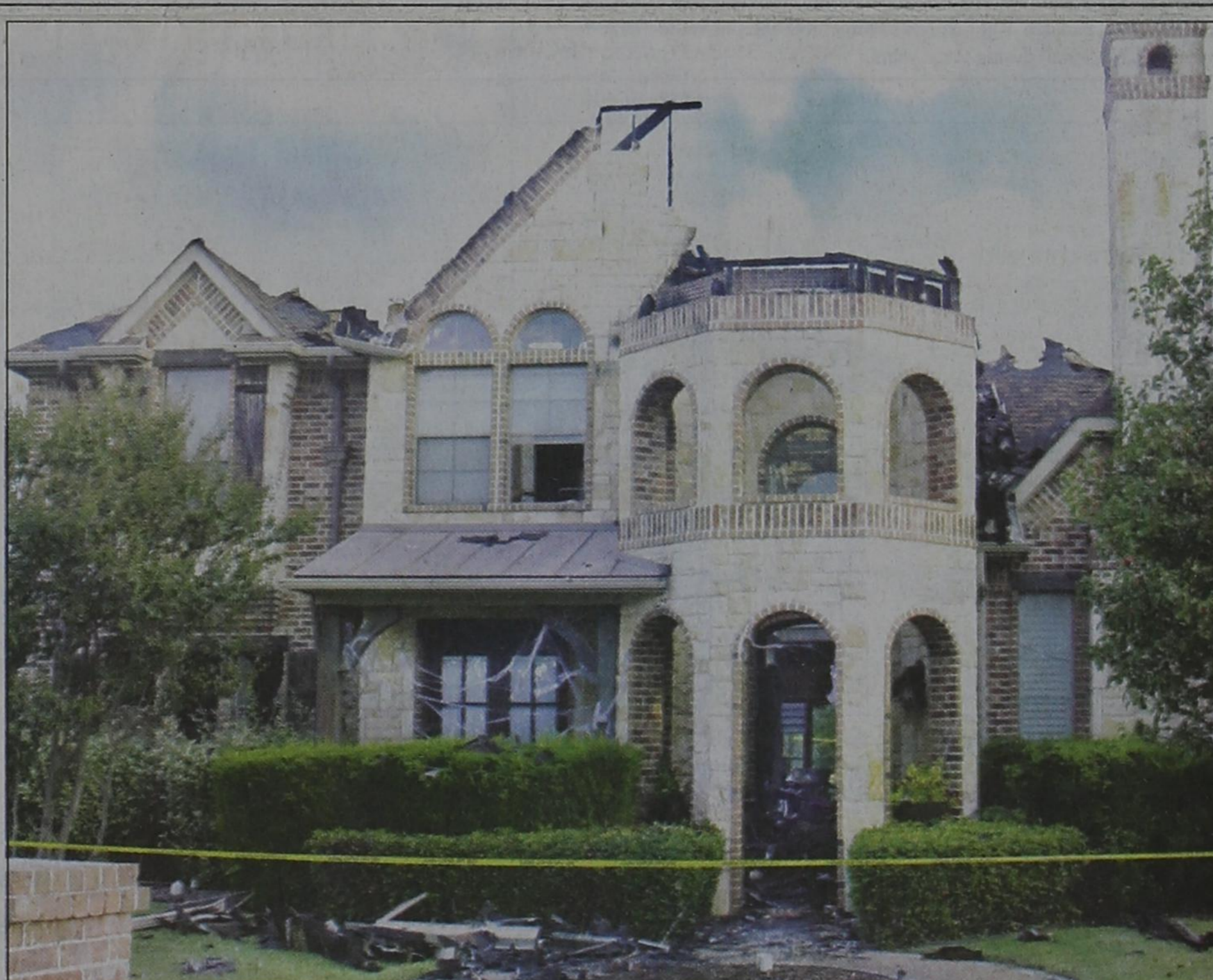
A residential structure at 104 Mont Blanc in Heath suffered extensive fire damage, at approximately 6:30 p.m., Sat. Oct. 1, 2016. According to Heath Fire Marshal Billy Termin, the fire is still under investigation. The above photo was taken Tues., Oct. 4, during early morning.