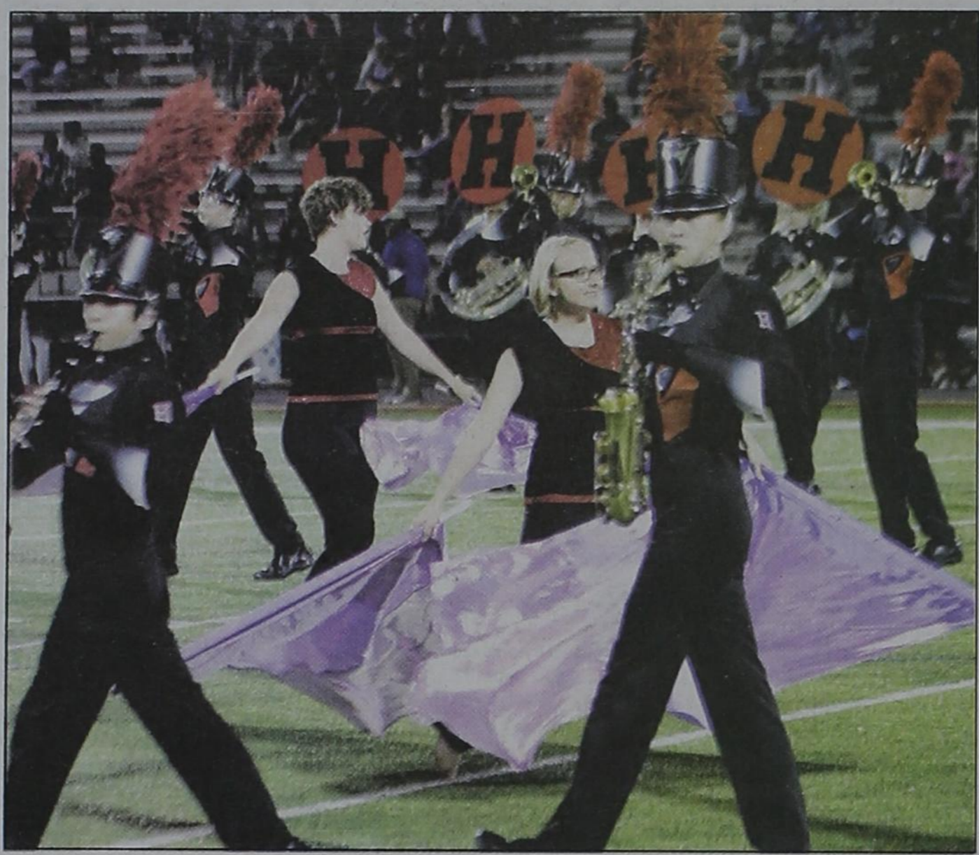
The Rockwall-Heath Mighty Hawk Band performs their contest show entitled, "An American in Paris," Fri. Sept. 30, 2016, during the football game against North Mesquite at Wilkerson-Sanders Stadium in Rockwall.