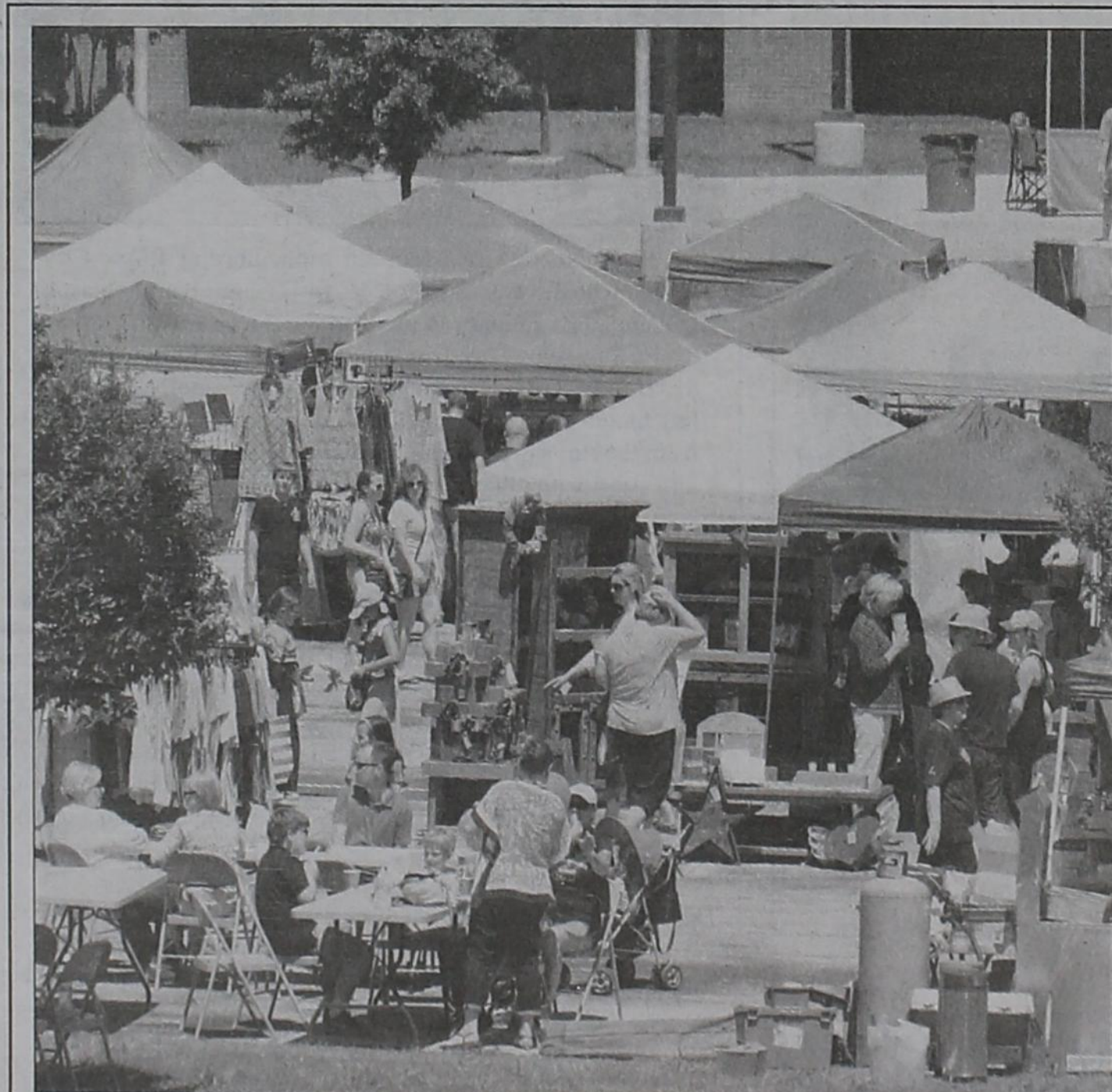
The Aspasians Arts & Crafts Fair was accompanied by nice sunny weather, Sat. April 25, after Friday's heavy rainfall. People from Rockwall County and the surrounding area shopped and enjoyed a wide variety of artwork and crafts throughout the day.