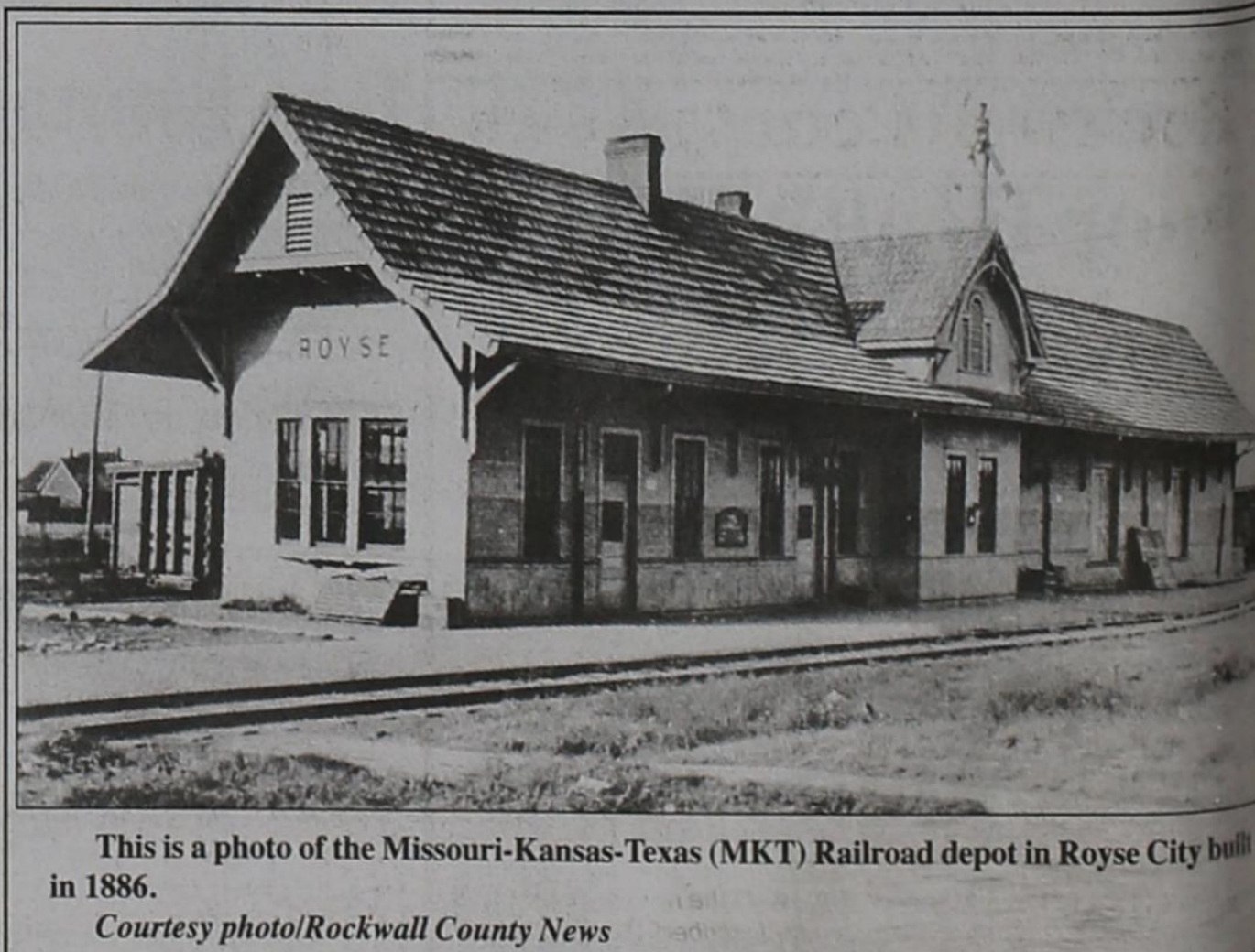
This is a photo of the Missouri-Kansas-Texas (MKT) Railroad depot in Roysie City built in 1886.

Want more copies of the Rockwall County News? Purchase at the following locations • Rockwall - Krogers, Scotties Exxon, Walmart, Chevron (Ridge Road & I-30), Gateway Shell (Hwy 276), Downtown on the square (coin rack), 7-11 (intersection Highways 205 and 552), 7-11 (Hwy 205 and Yellowjacket Lane) • Rowlett - Walmart Neighborhood (Hwy 66 and Dalrock Road) • Roysie City - Tiger Mart, Main Street (coin rack), McDonald's (coin rack) • Fate - Fate Grocery Store.