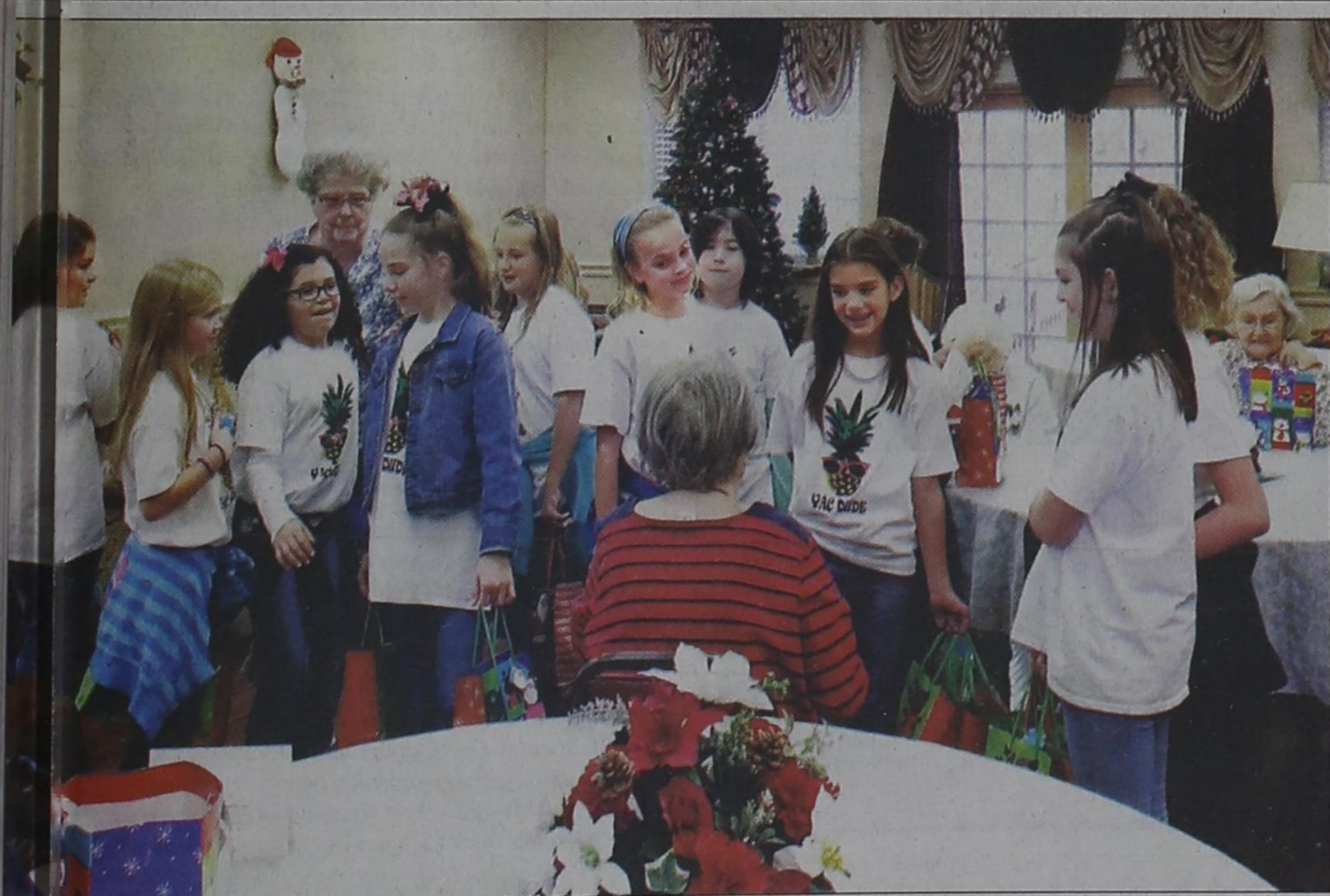
The Hartman Elementary Youth Advisory Committee members recently visited Reese Manor where they sang Christmas carols and delivered holiday snacks.