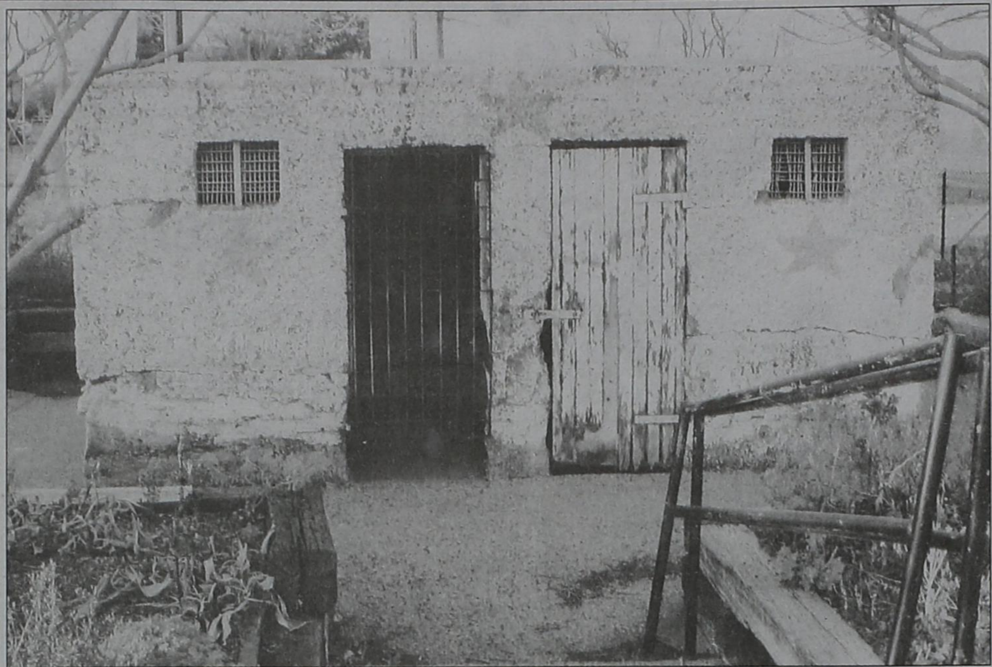
The decaying historical Royse City jail (calaboose) is the subject of an organization accepting donations for its preservation. More information can be found online at Calaboose Restoration Project on Facebook.