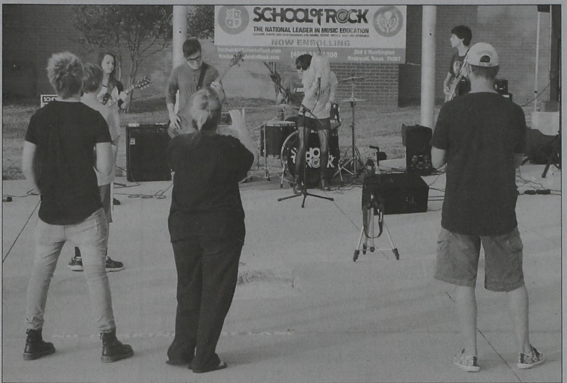
Young musicians from the Rockwall County area perform a variety rock music, Fri. Aug. 28, while football fans line up for their tickets to watch the first game of the season at Wilkerson-Sanders Stadium in Rockwall.